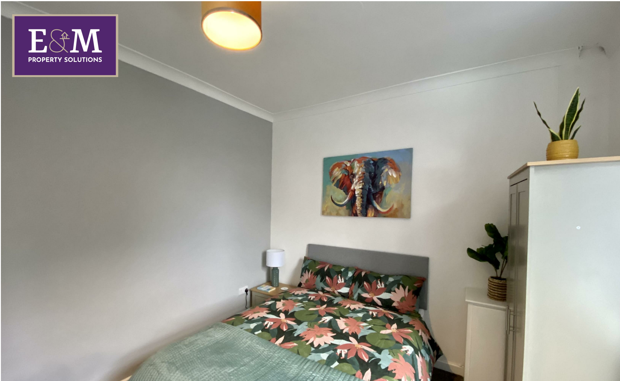
Room 1, 7 Ulster Street, Burnley, Lancashire, BB11 4NX £95 Per week