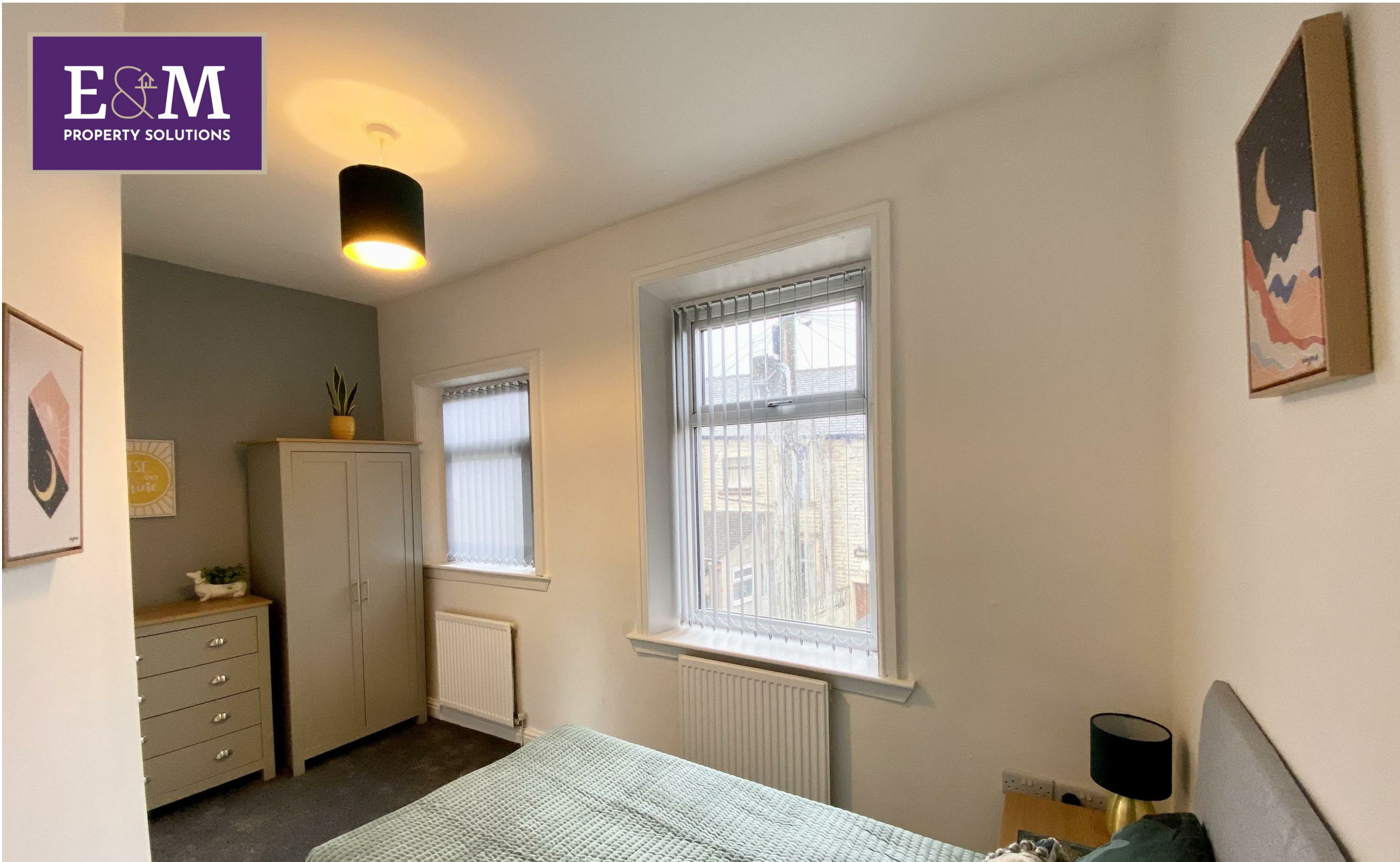
Room 2, 7 Ulster Street, Burnley, Lancashire, BB11 4NX £95 Per week