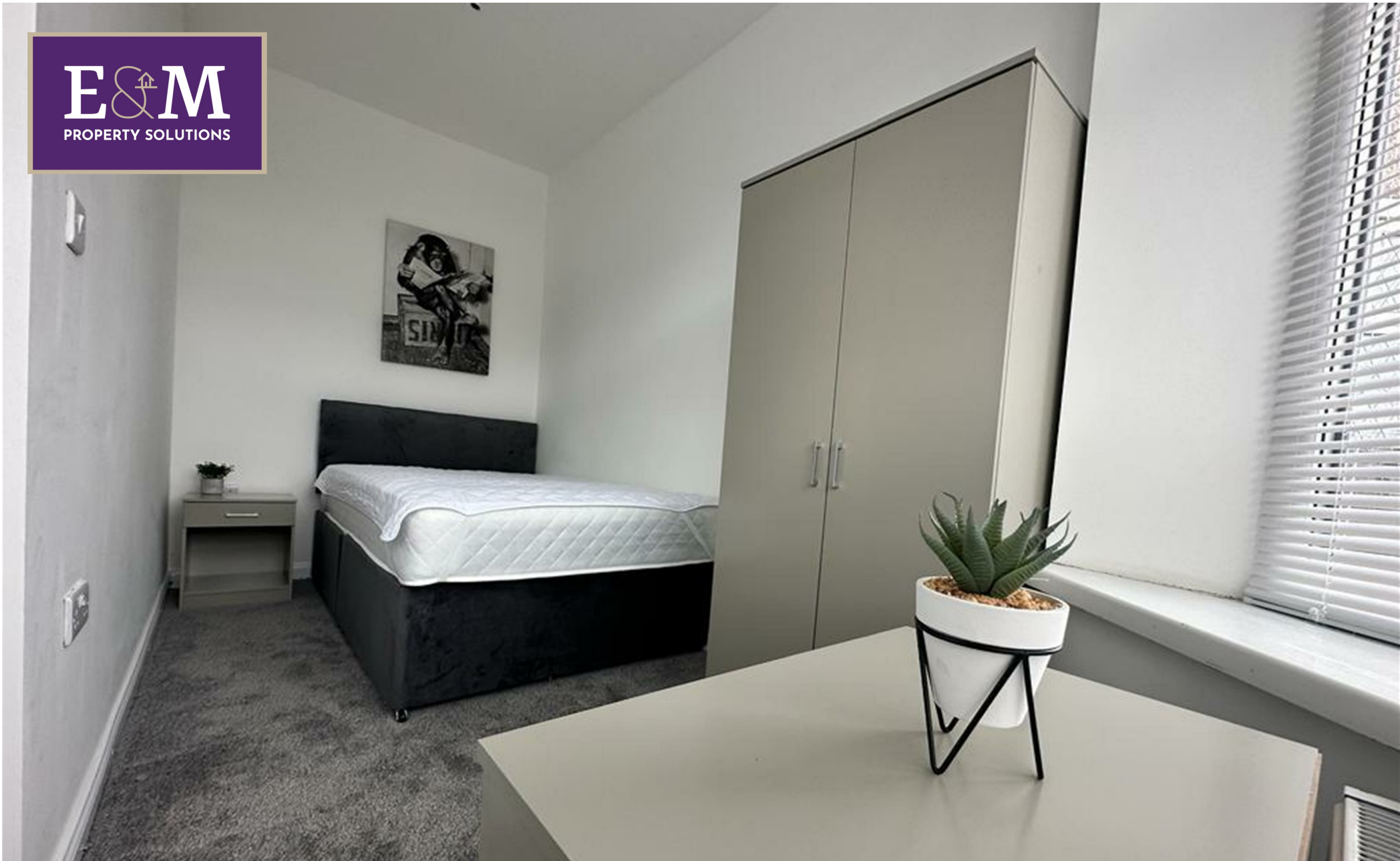
ROOM 1, 369 Brunshaw Road, Burnley, Lancashire, BB10 3HX £90 Per week