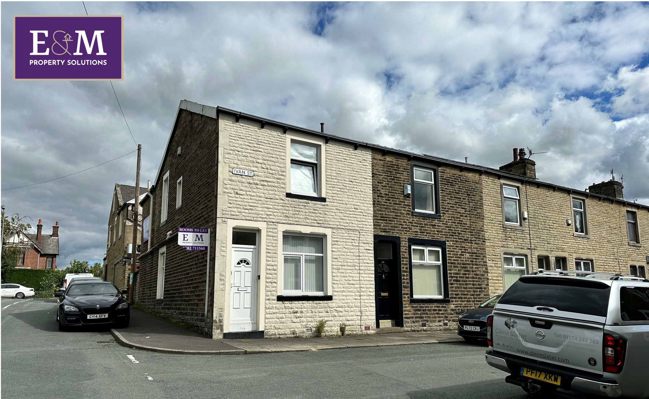
27 Ivan Street, Burnley, Lancashire, BB10 1ES Offers in the region of £145,000