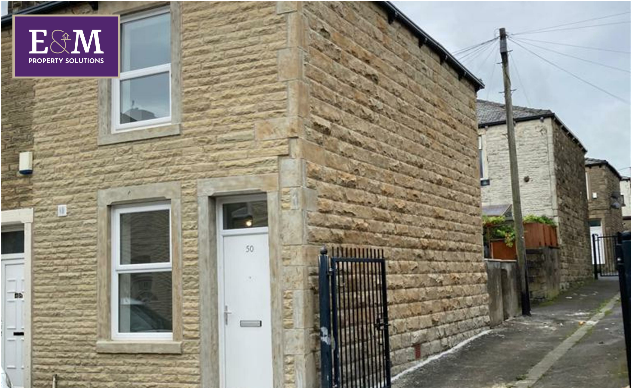
50 Grange Street, Burnley, BB11 4JZ £625 Per month