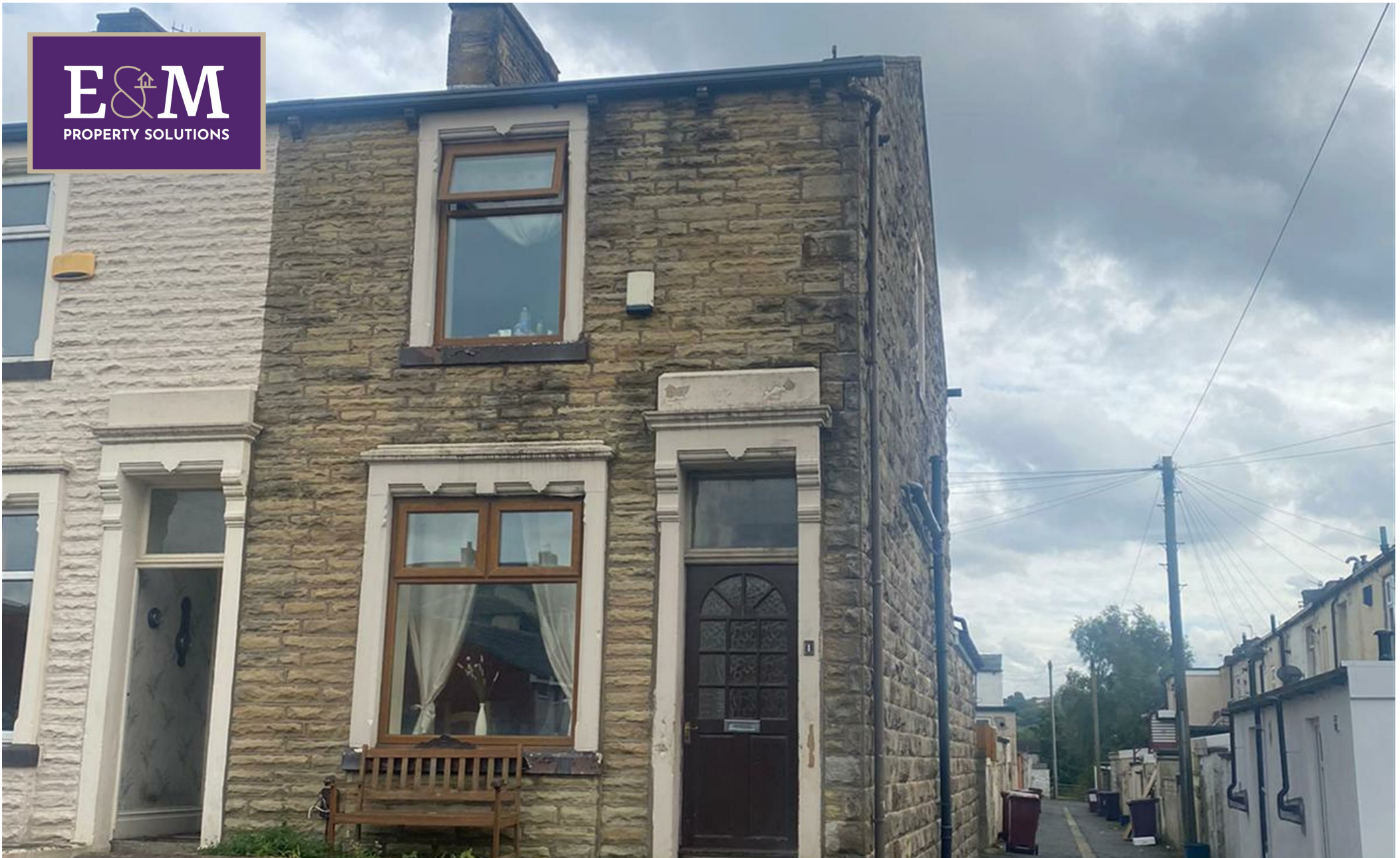
1 Claremont Street, Burnley, Lancashire, BB12 0HG Asking price £85,000