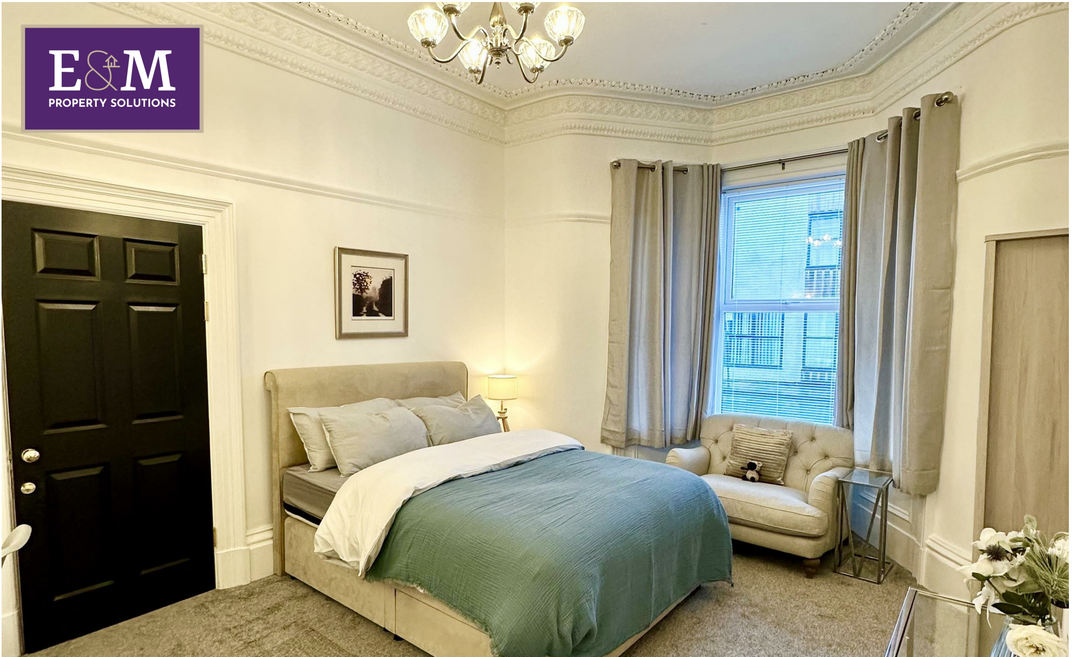
ROOM 1, 54 Bank Parade, Burnley, Lancashire, BB11 1TS £150 Per week