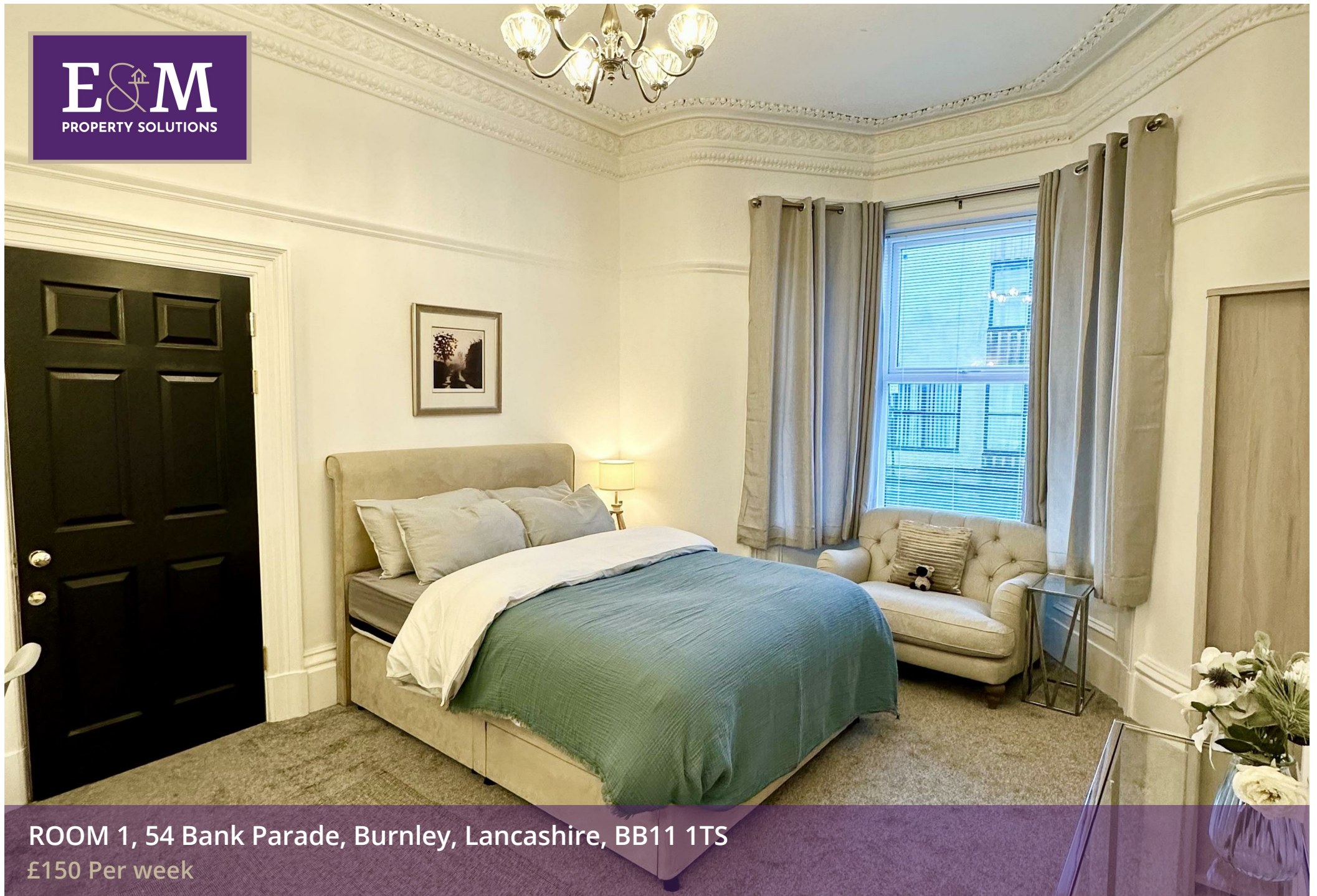
ROOM 1, 54 Bank Parade, Burnley, Lancashire, BB11 1TS £150 Per week