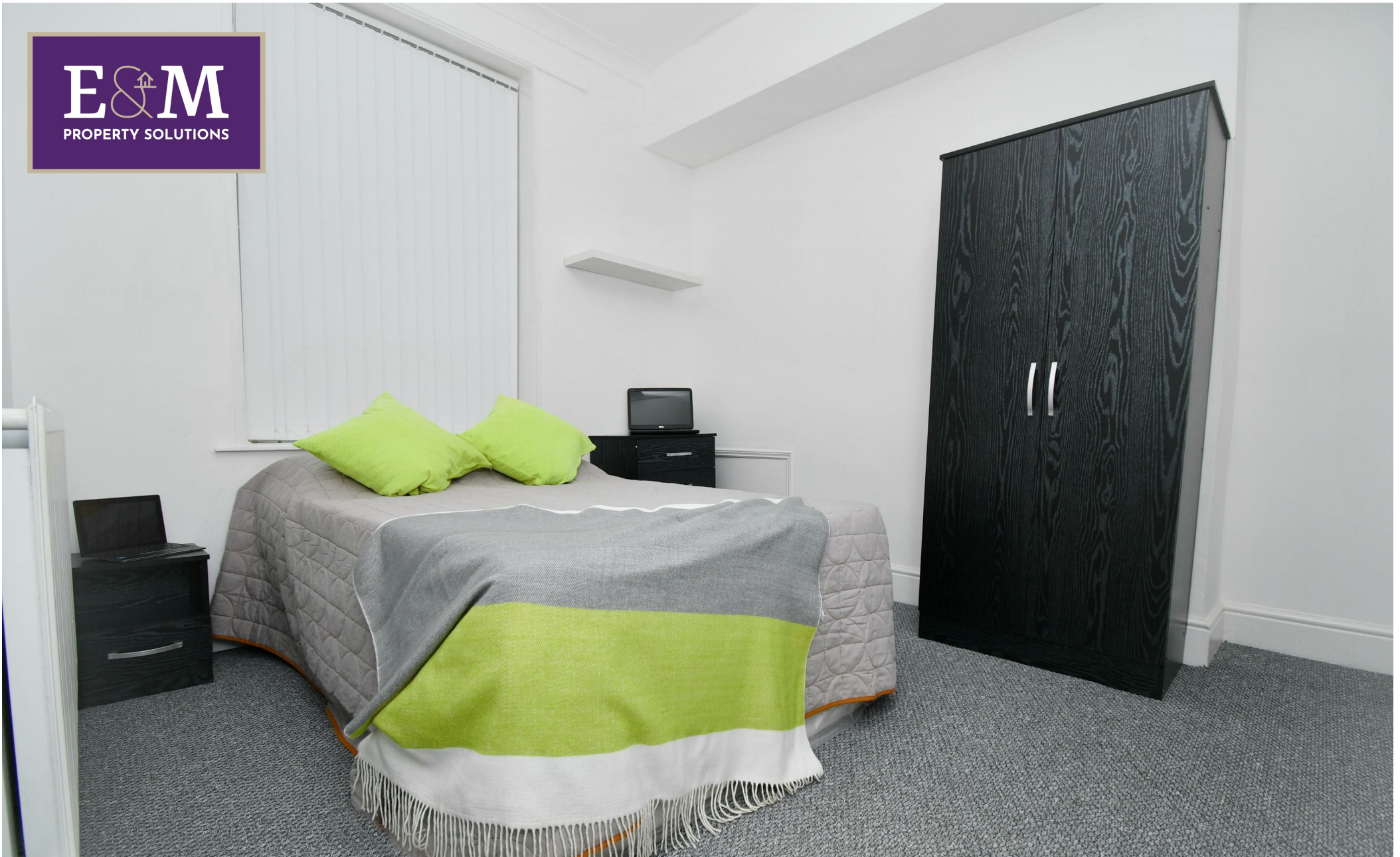
40 Berry Street, Burnley, Lancashire, BB11 2LG Offers in the region of £110,000