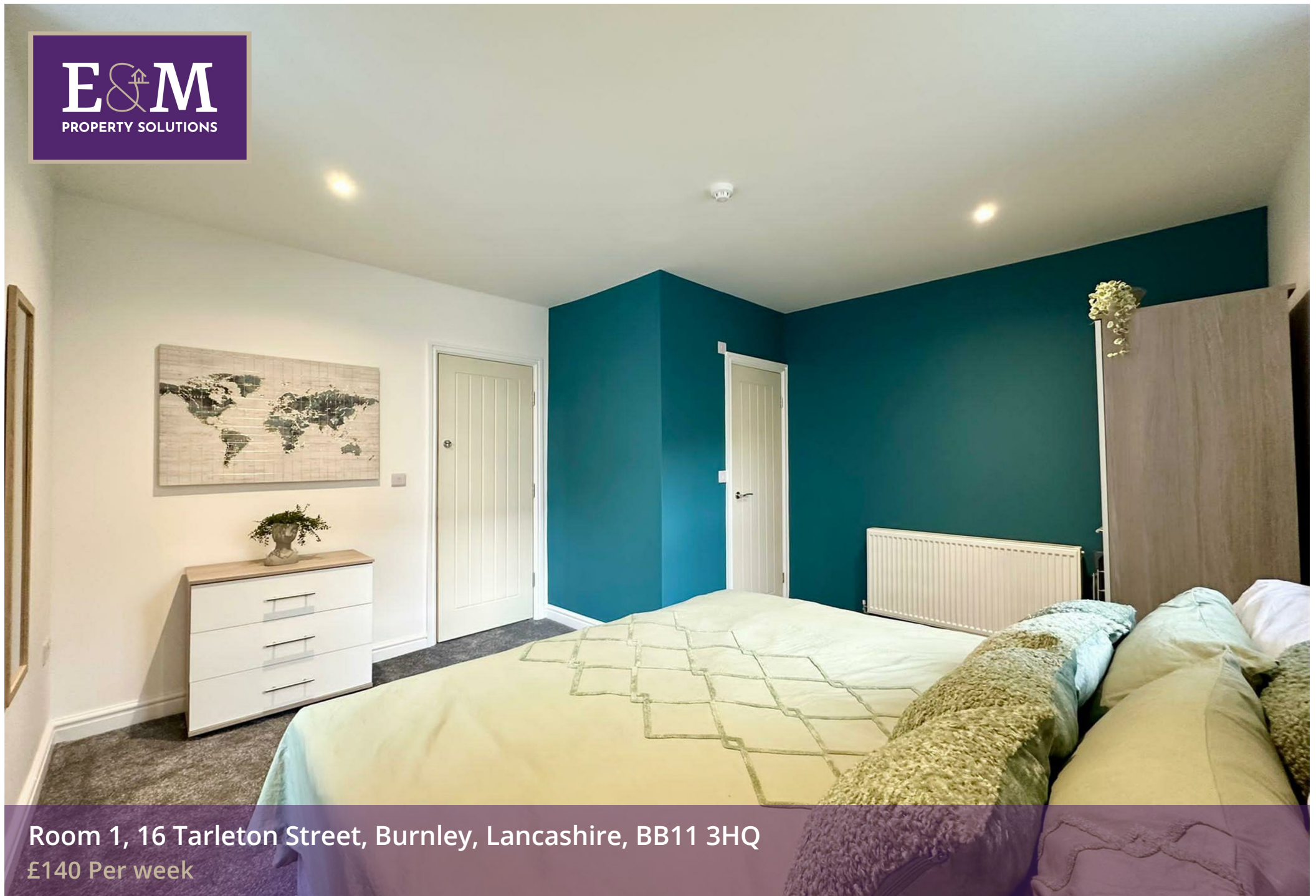
Room 1, 16 Tarleton Street, Burnley, Lancashire, BB11 3HQ £140 Per week