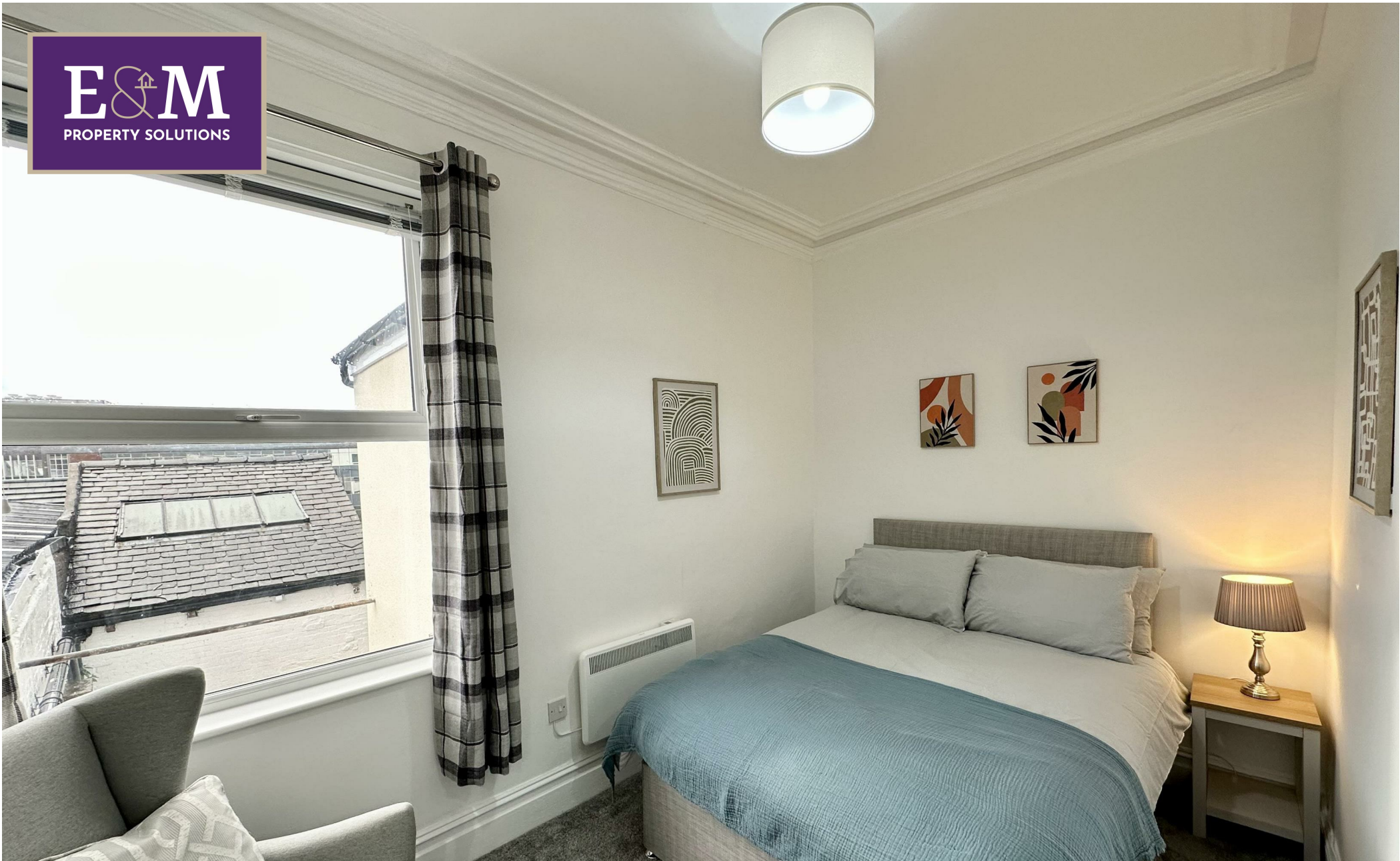
ROOM 2, 54 Bank Parade, Burnley, BB11 1TS £150 Per week