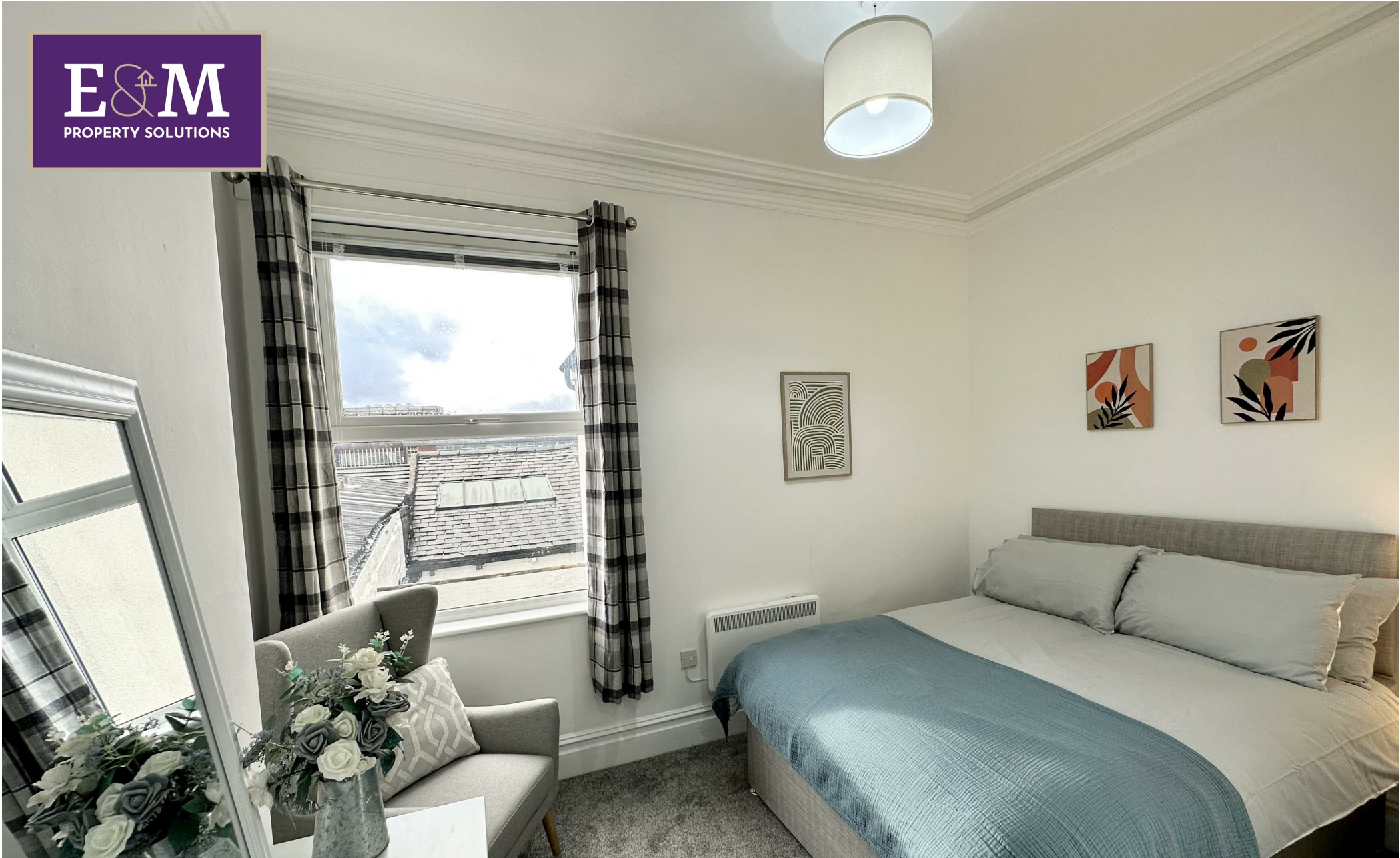
ROOM 2, 54 Bank Parade, Burnley, BB11 1TS £150 Per week