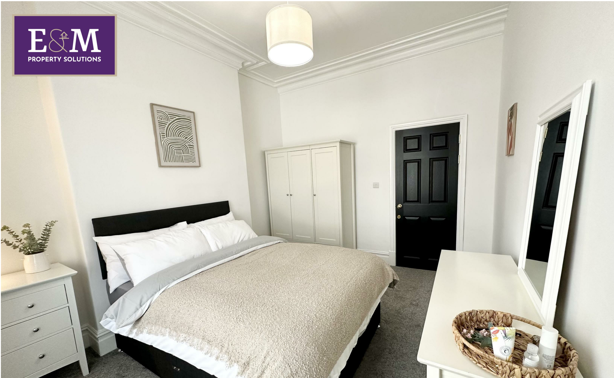
ROOM 3, 54 Bank Parade, Burnley, BB11 1TS £150 Per week