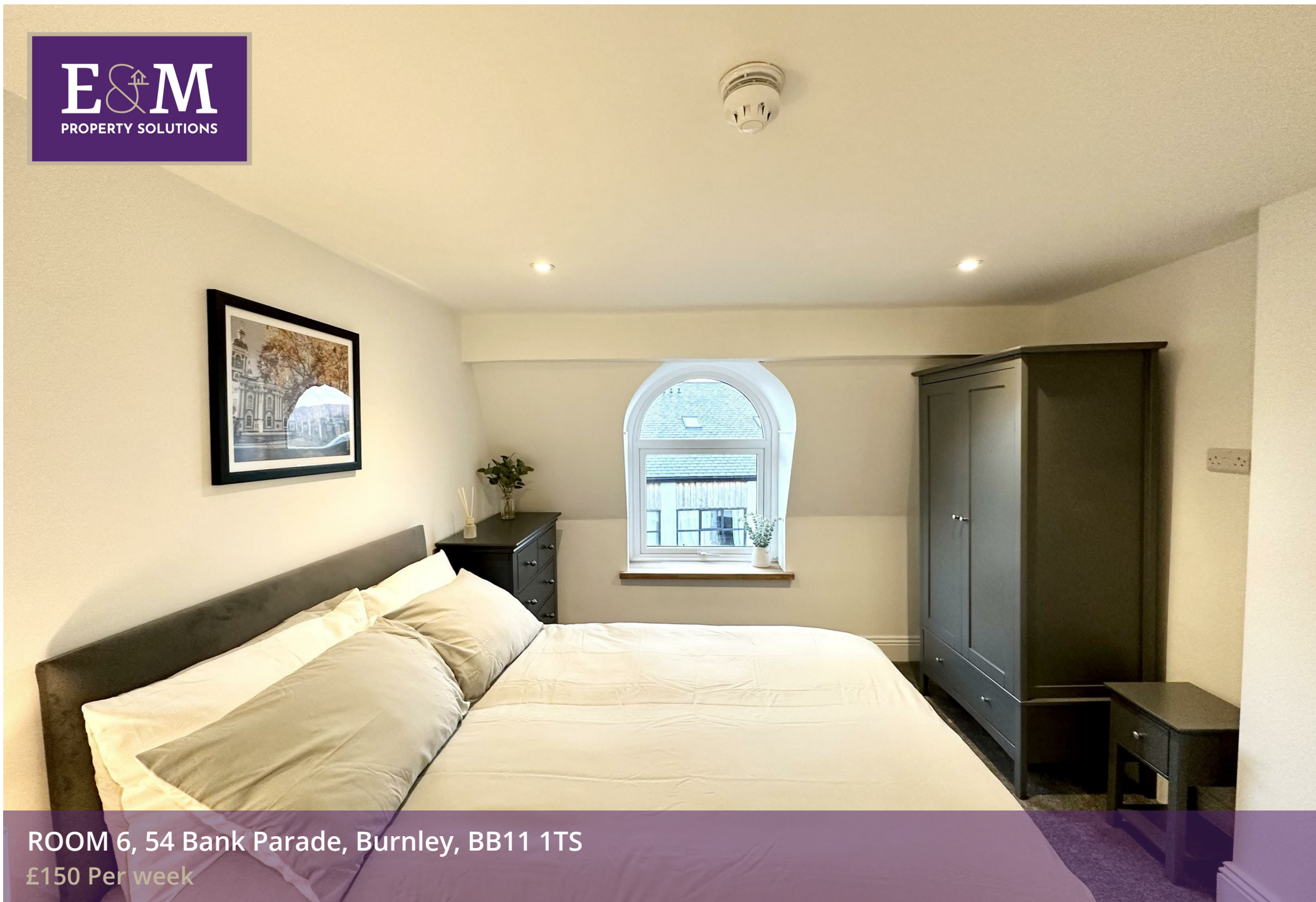
ROOM 6, 54 Bank Parade, Burnley, BB11 1TS £150 Per week