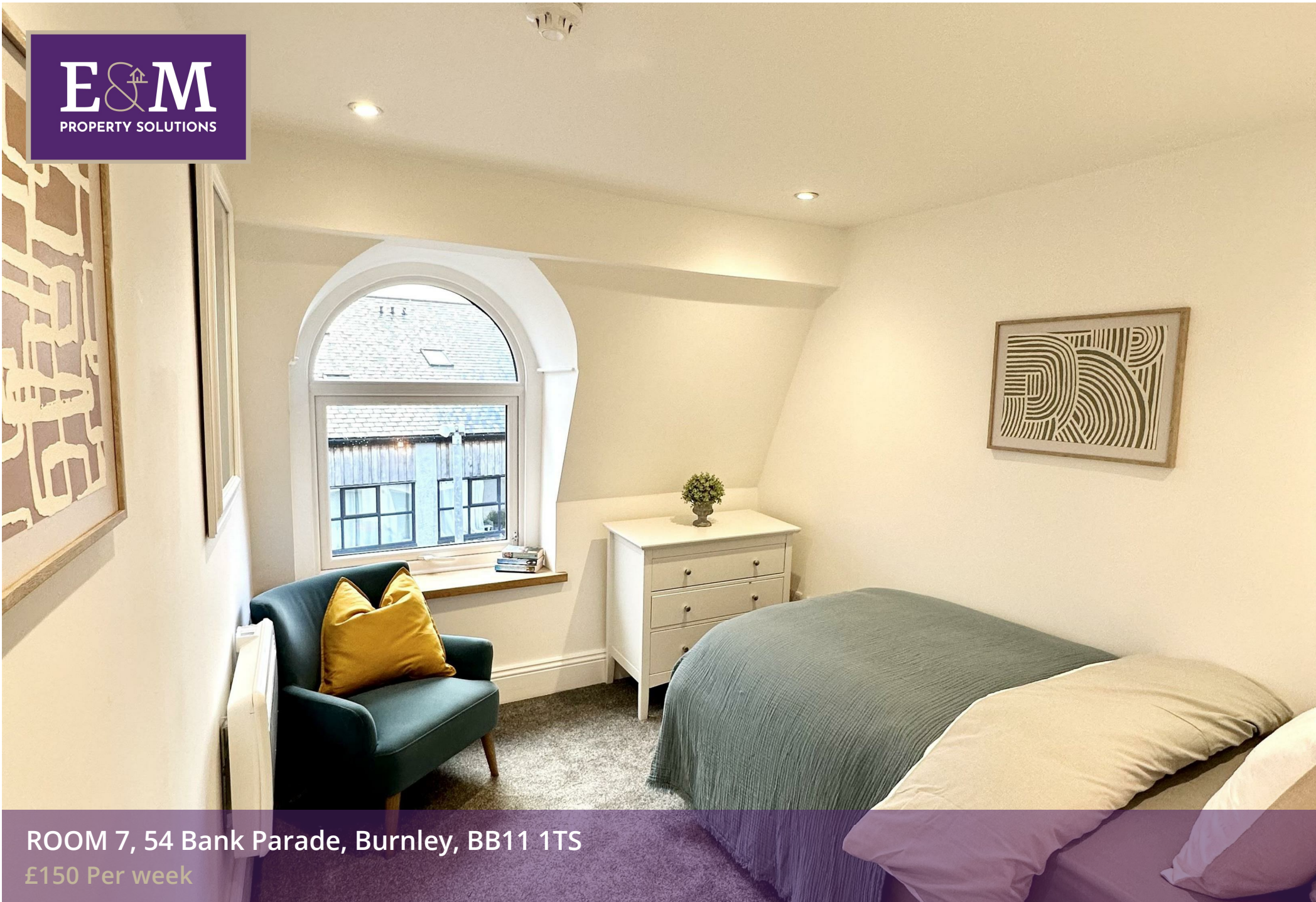
ROOM 7, 54 Bank Parade, Burnley, BB11 1TS £150 Per week