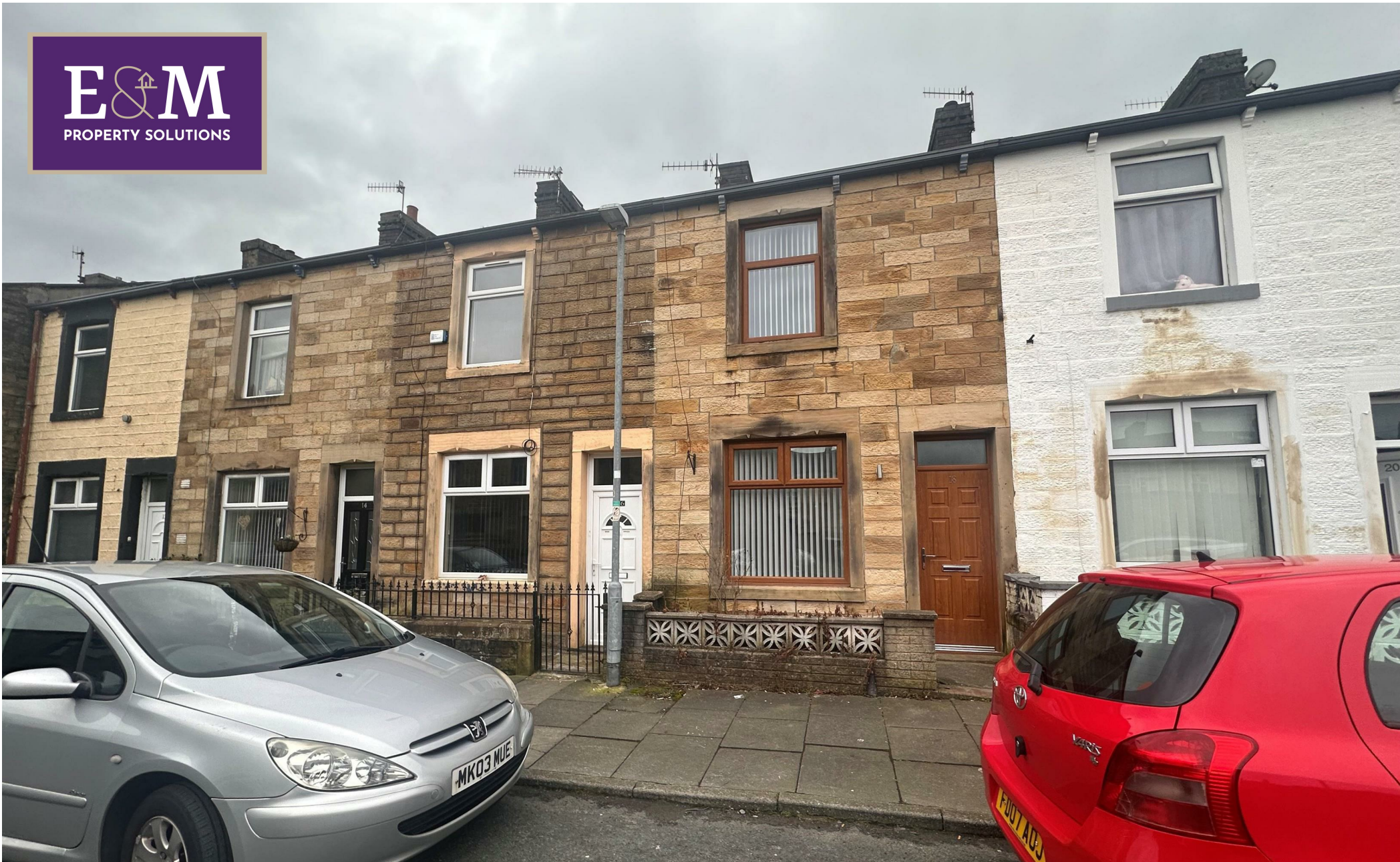
18 Acre Street, Burnley, Lancashire, BB10 3HS Asking price £80,000