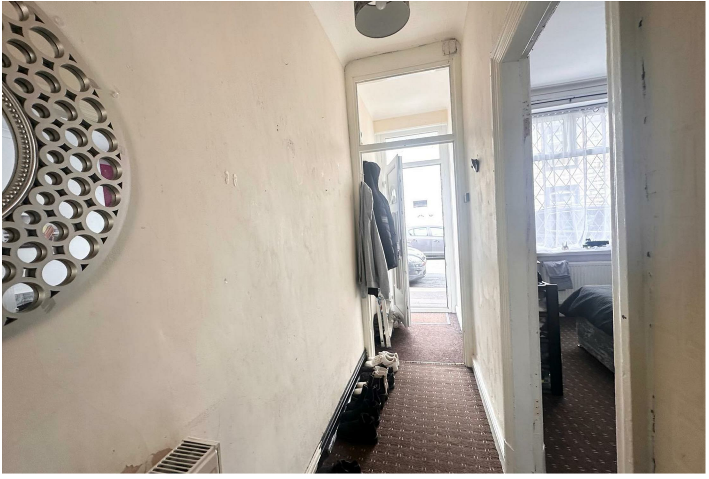
43 Towneley Street, Burnley, BB10 1UJ