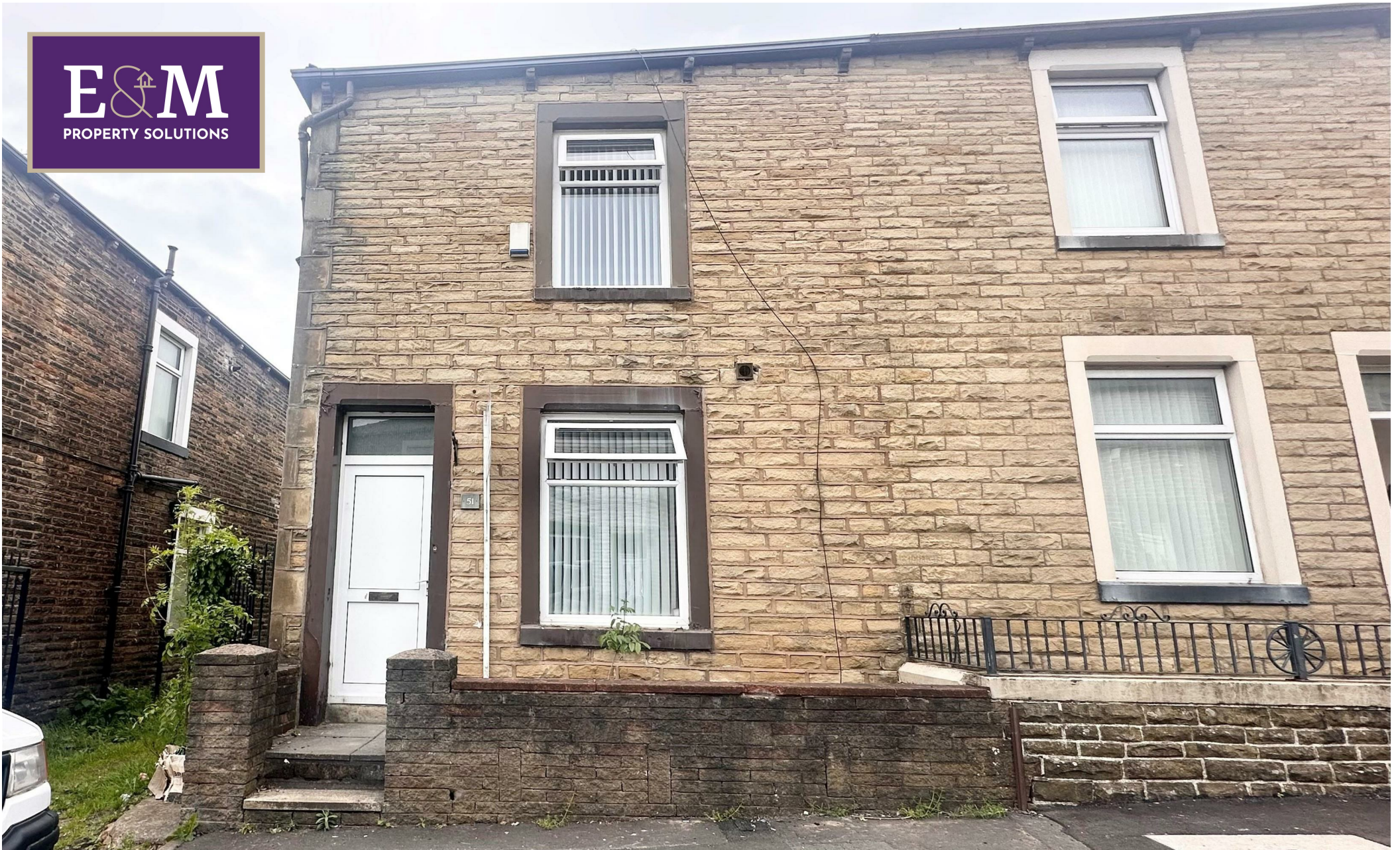
51 Colbran Street, Burnley, Lancashire, BB10 3BU Asking price £115,000