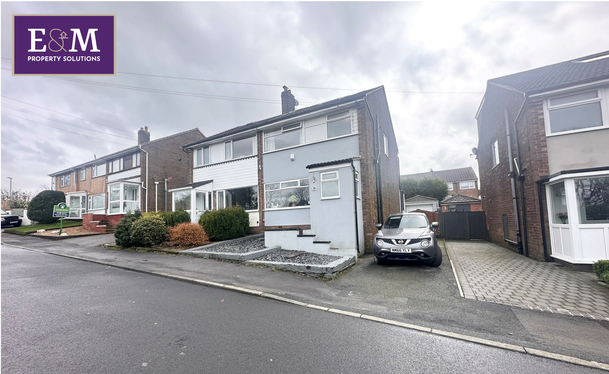
30 Hollowhead Lane, Wilpshire, Blackburn, BB1 9JX Offers in the region of £265,000