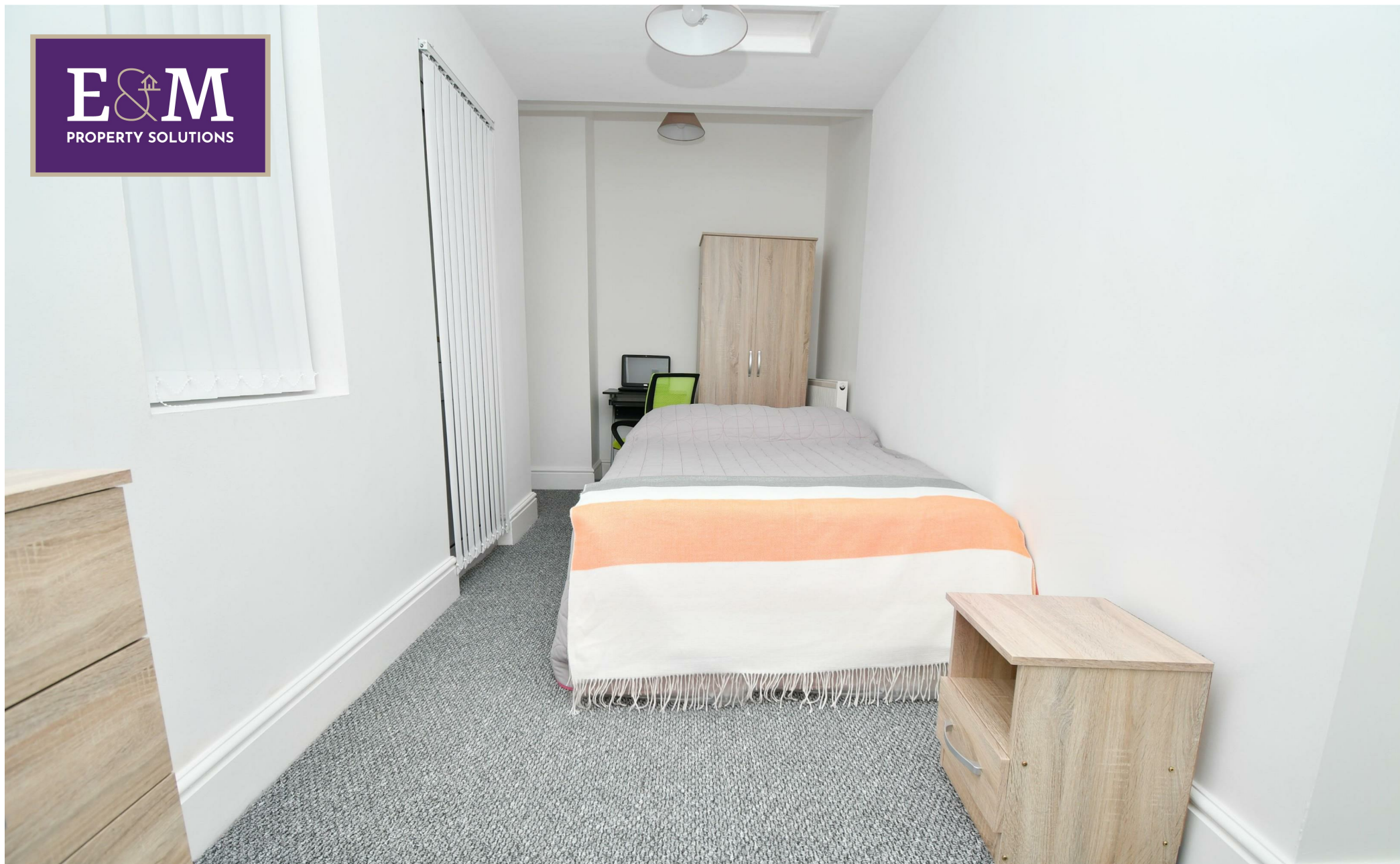
ROOM 2, 19 Netherby Street, Burnley, Lancashire, BB11 4NR £105 Per week