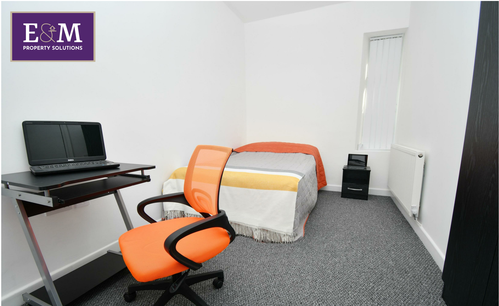
room 2, 4 Scarlett Street, Burnley, Lancashire, BB11 4LQ £450 Per month