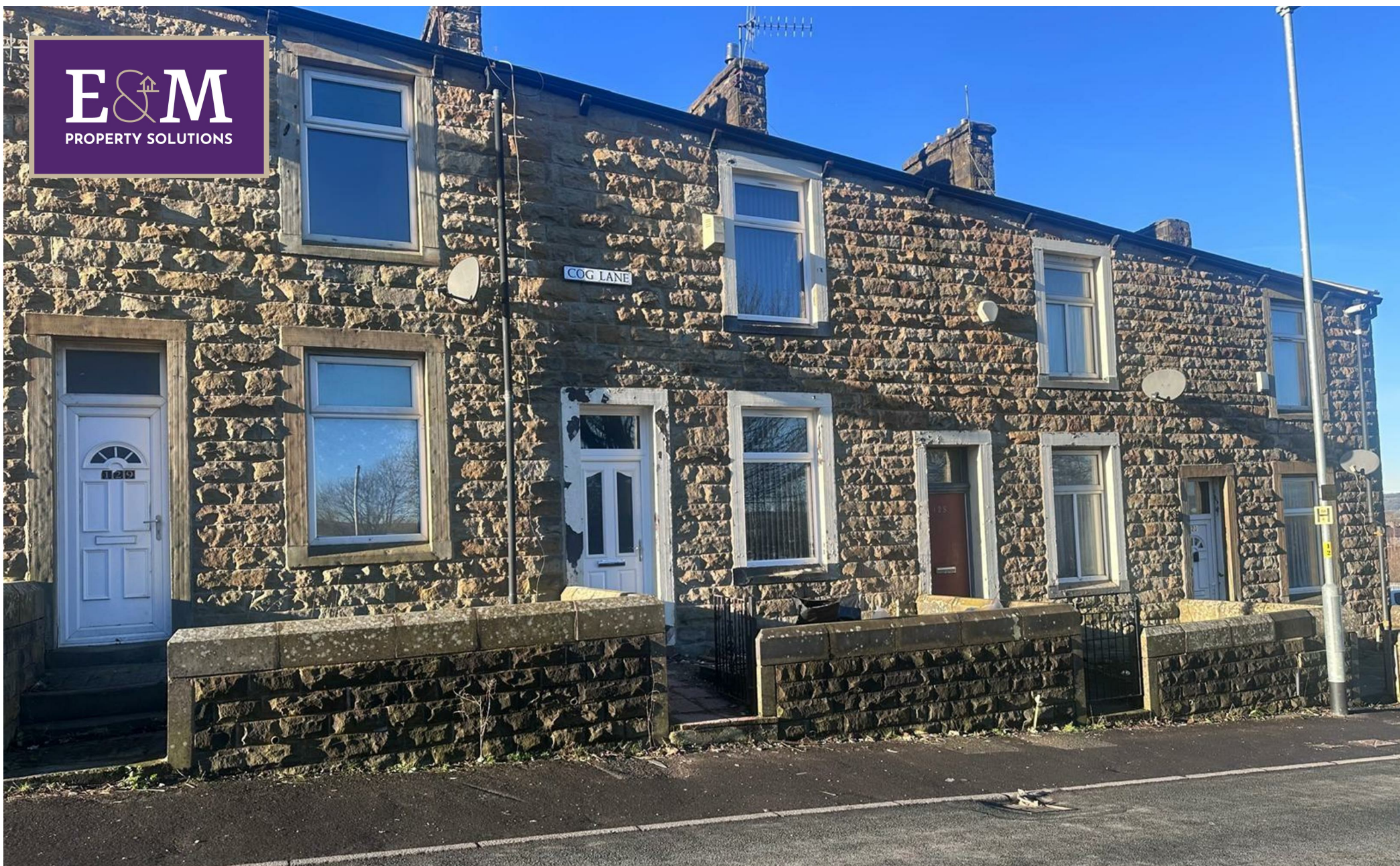
127 Cog Lane, Burnley, Lancashire, BB11 5JU £595 Per month