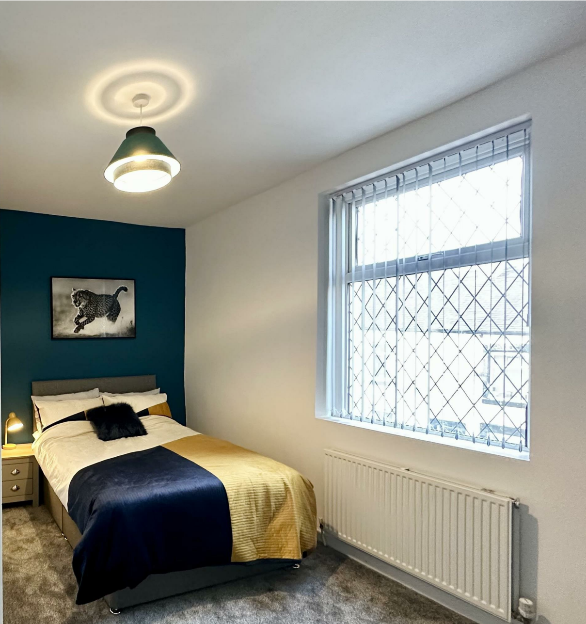
Room 3, 40 Berry Street, Burnley, Lancashire, BB11 2LG £115 Per week