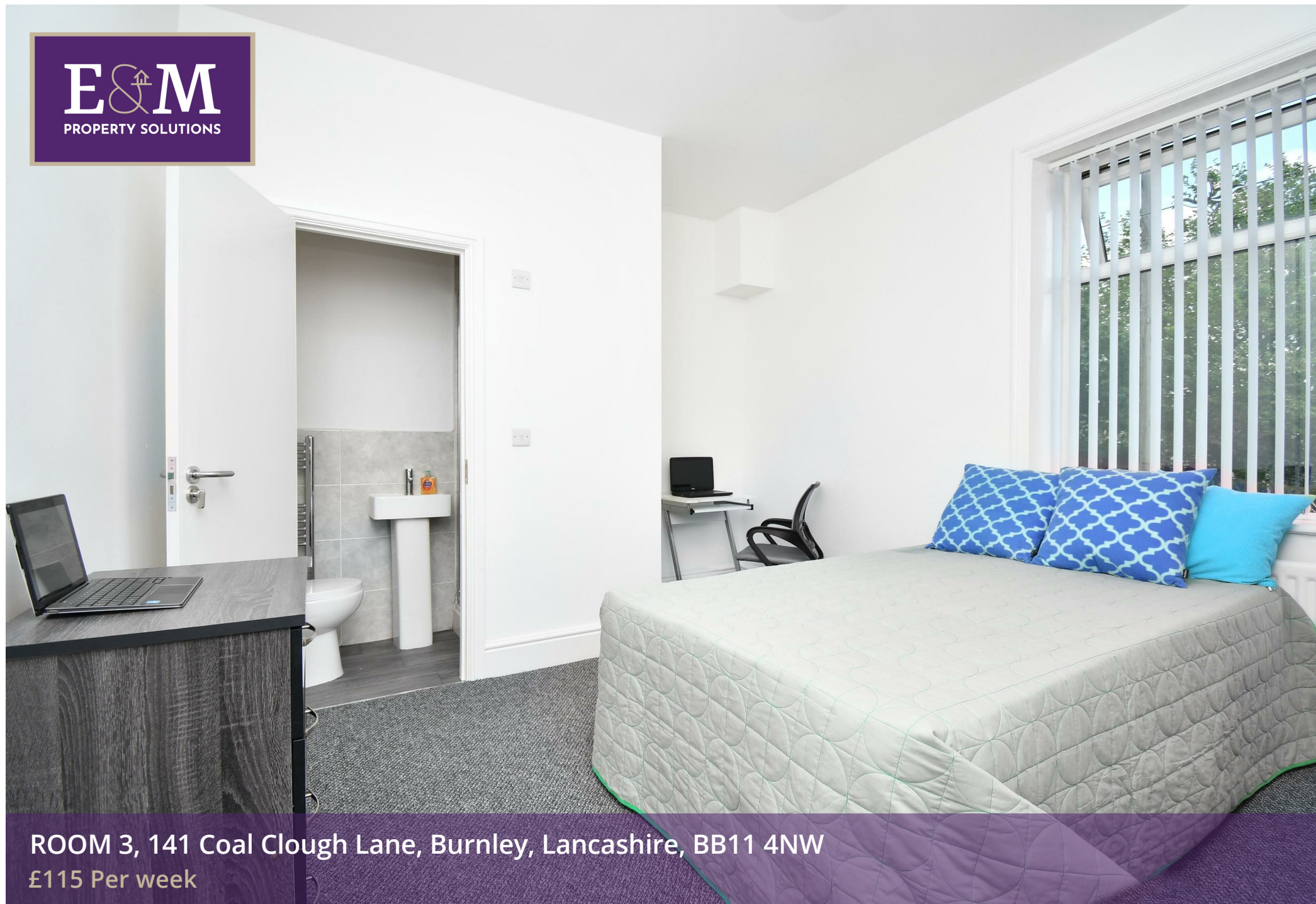
ROOM 3, 141 Coal Clough Lane, Burnley, Lancashire, BB11 4NW £115 Per week