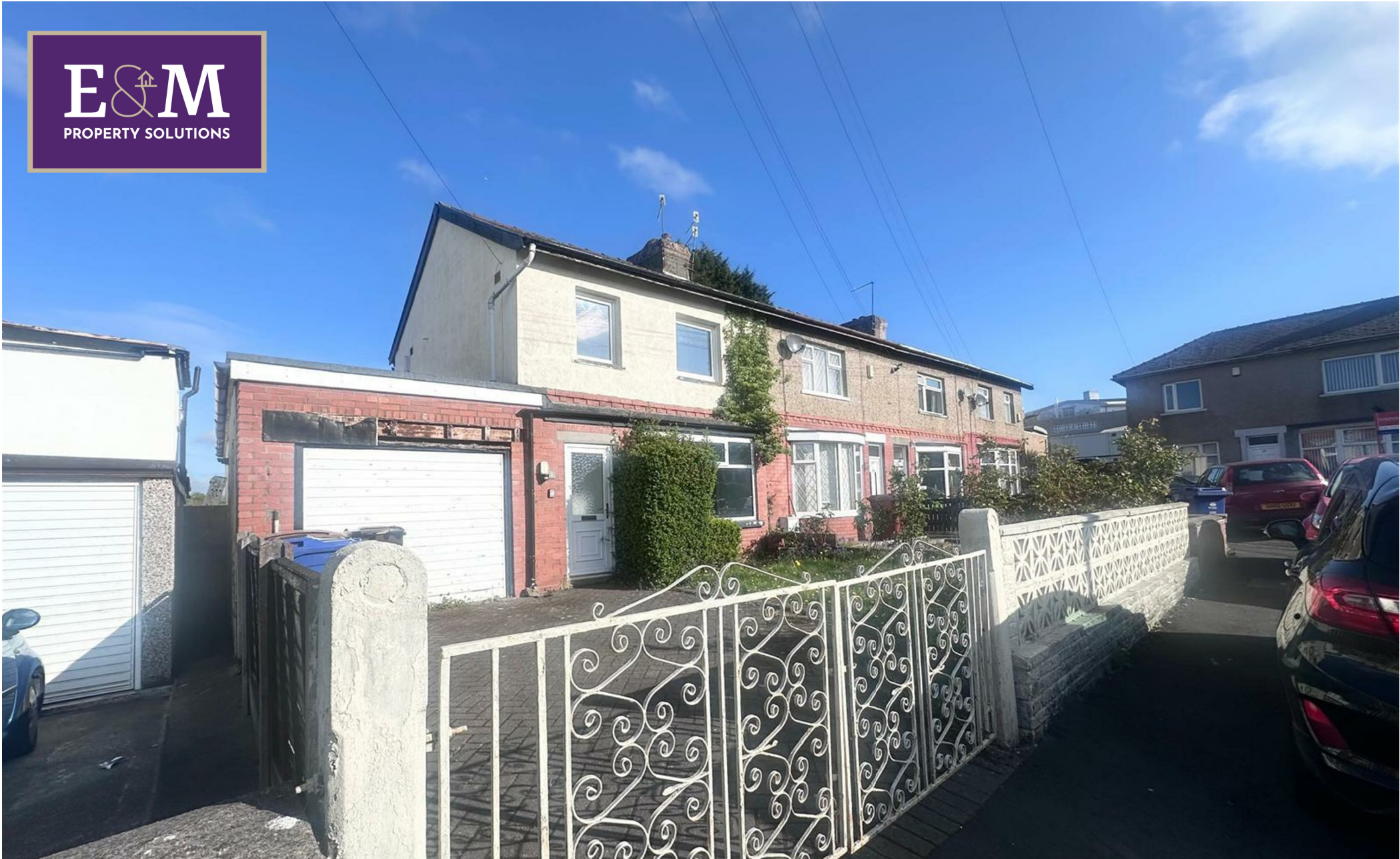
2 Hawes Terrace, Burnley, BB10 1UF £950 Per month