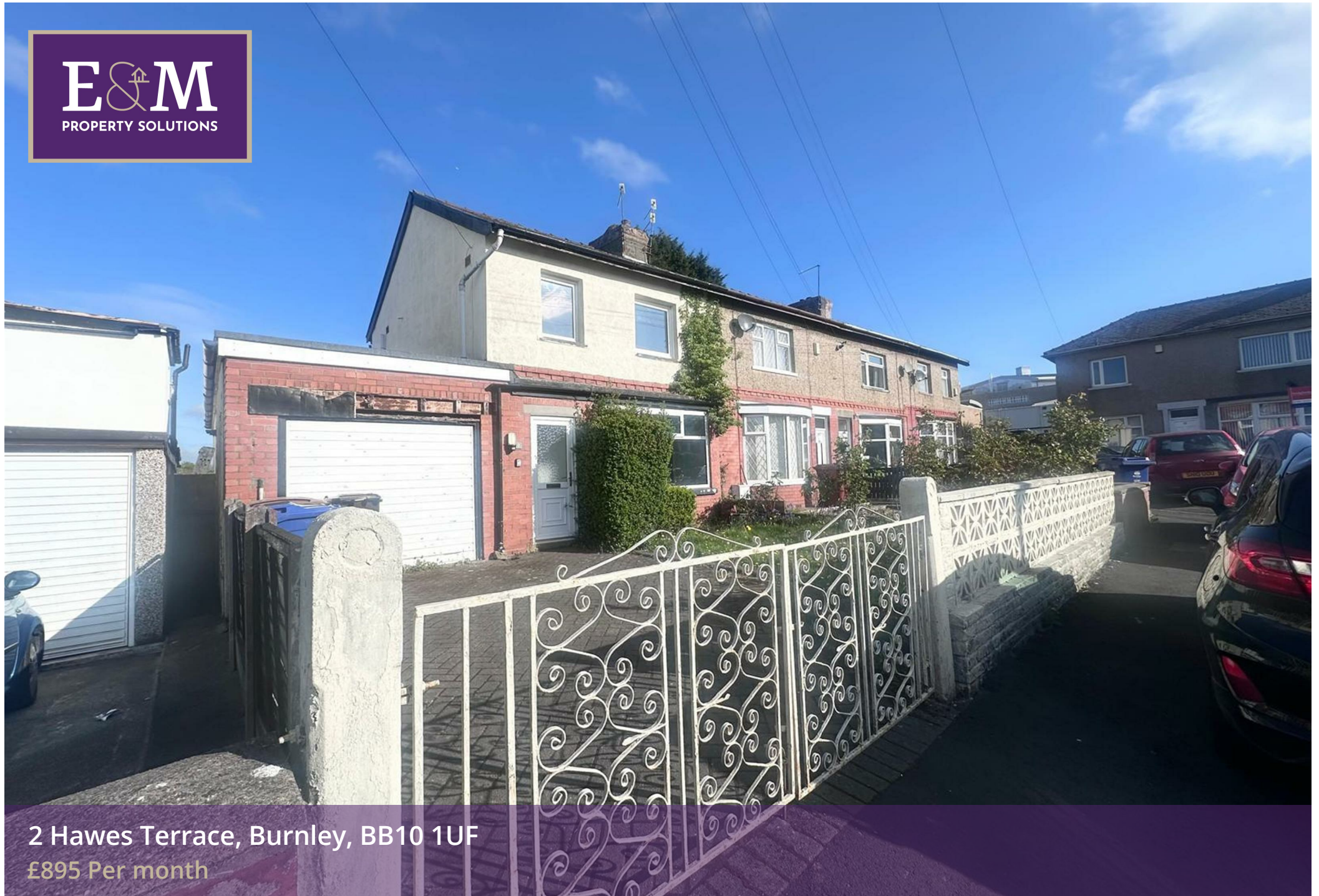
2 Hawes Terrace, Burnley, BB10 1UF £895 Per month