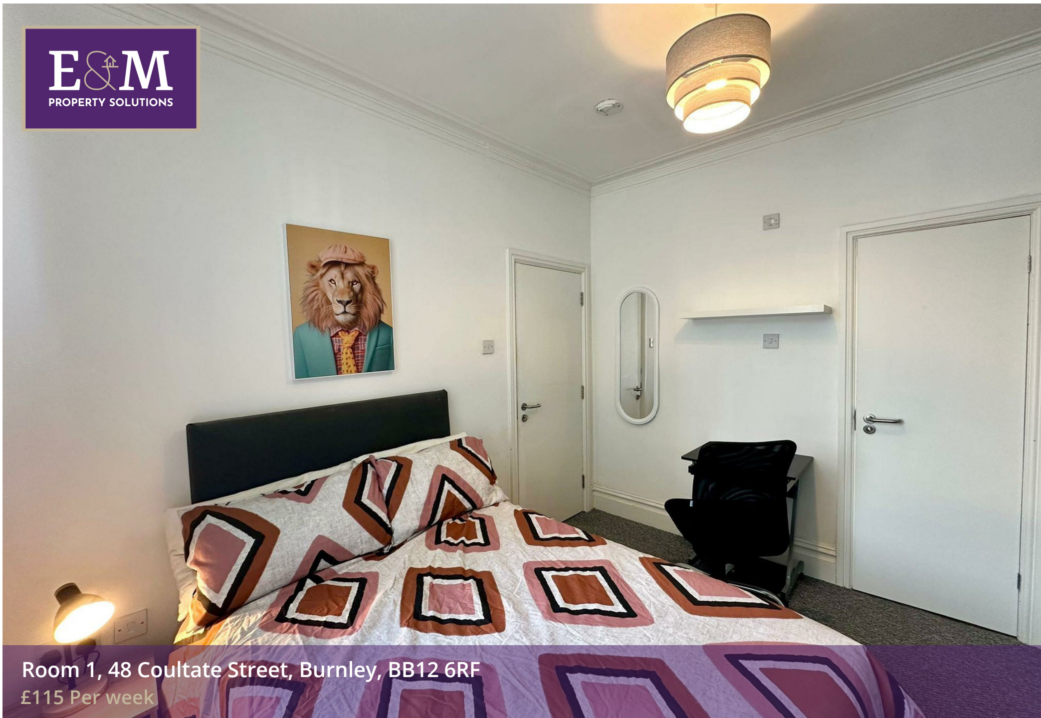
Room 1, 48 Coultate Street, Burnley, BB12 6RF £115 Per week