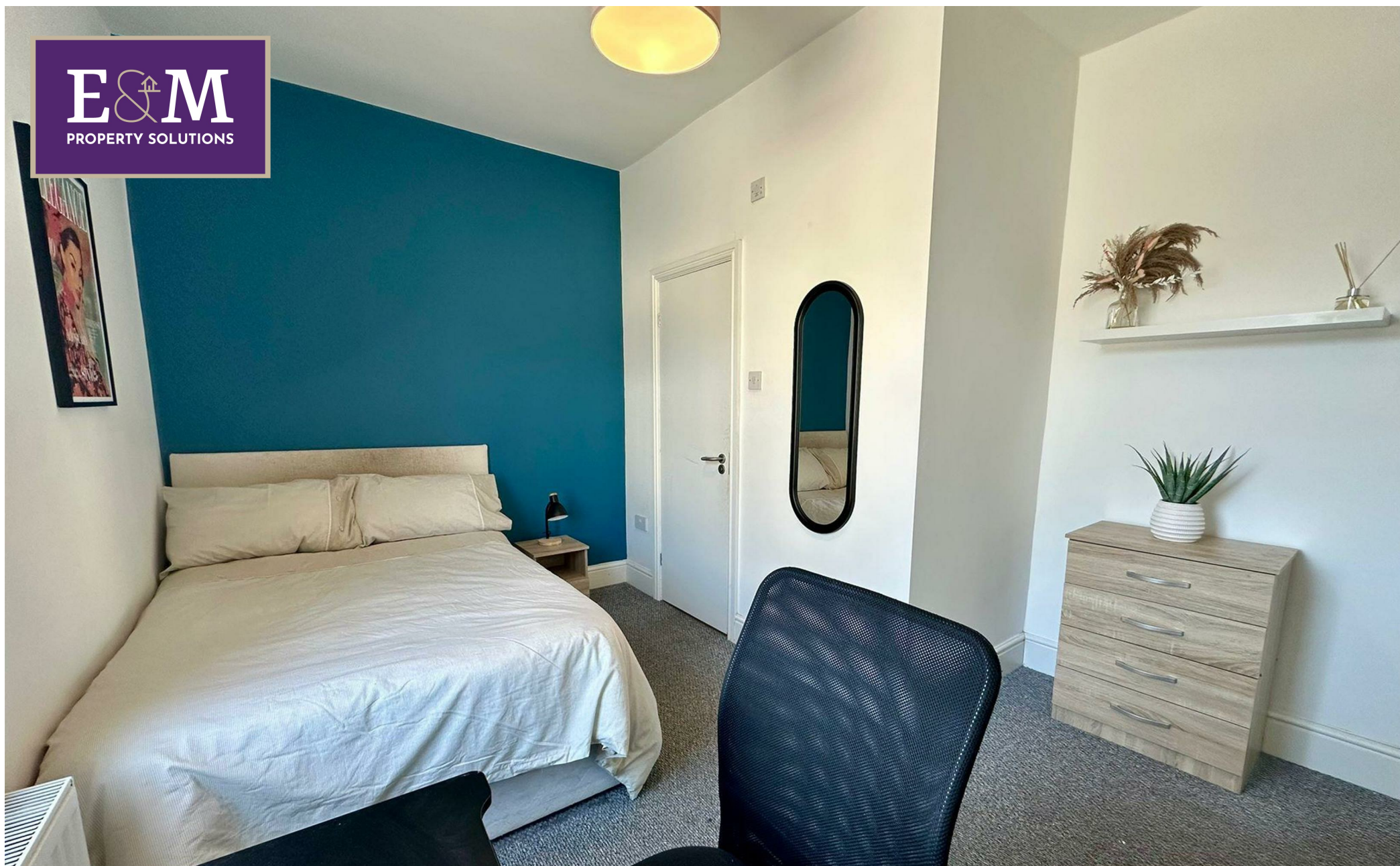
Room 3, 48 Coultate Street, Burnley, BB12 6RF £115 Per week