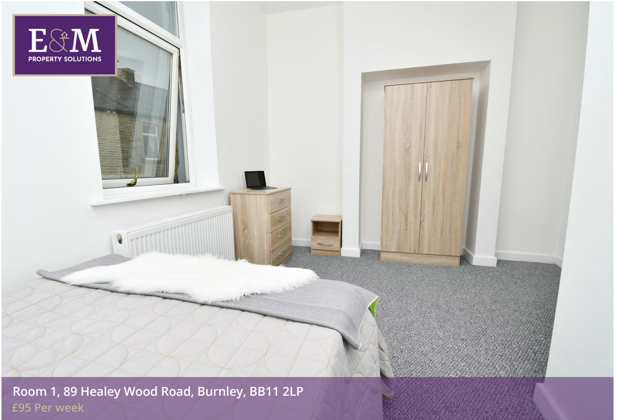
Room 1, 89 Healey Wood Road, Burnley, BB11 2LP £95 Per week