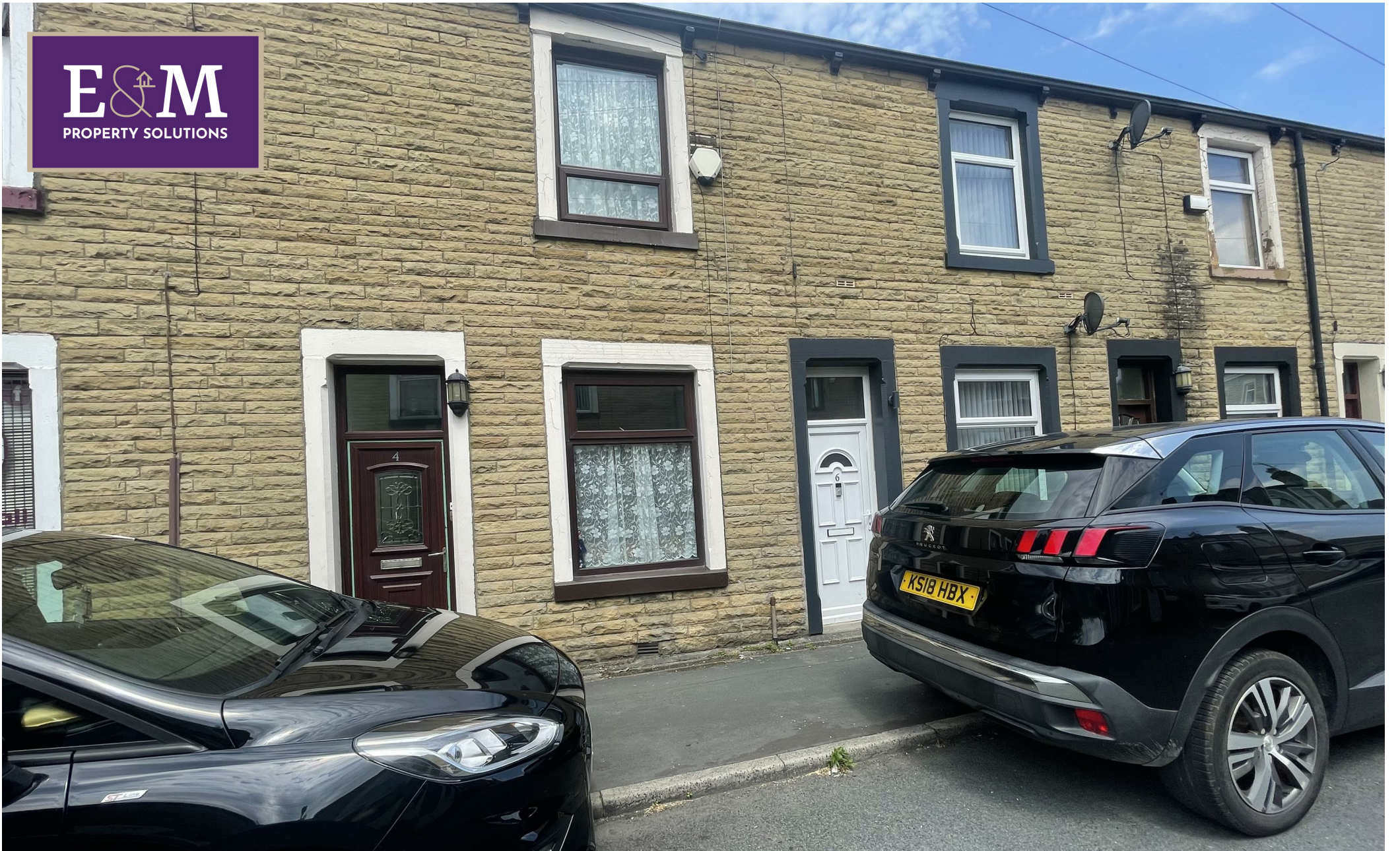
4 Prescott Street, Burnley, BB10 4DT Asking price £87,500