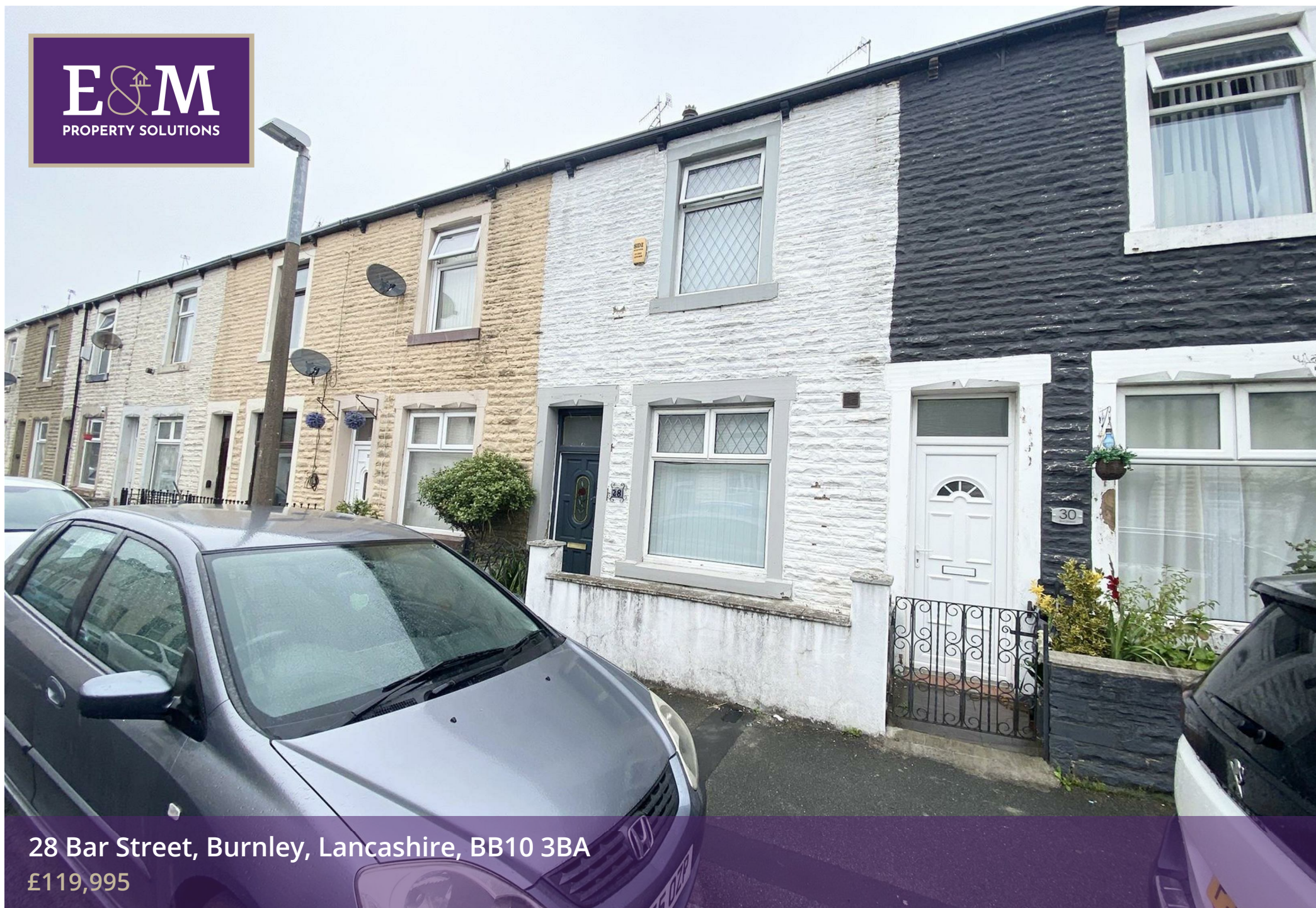
28 Bar Street, Burnley, Lancashire, BB10 3BA £119,995