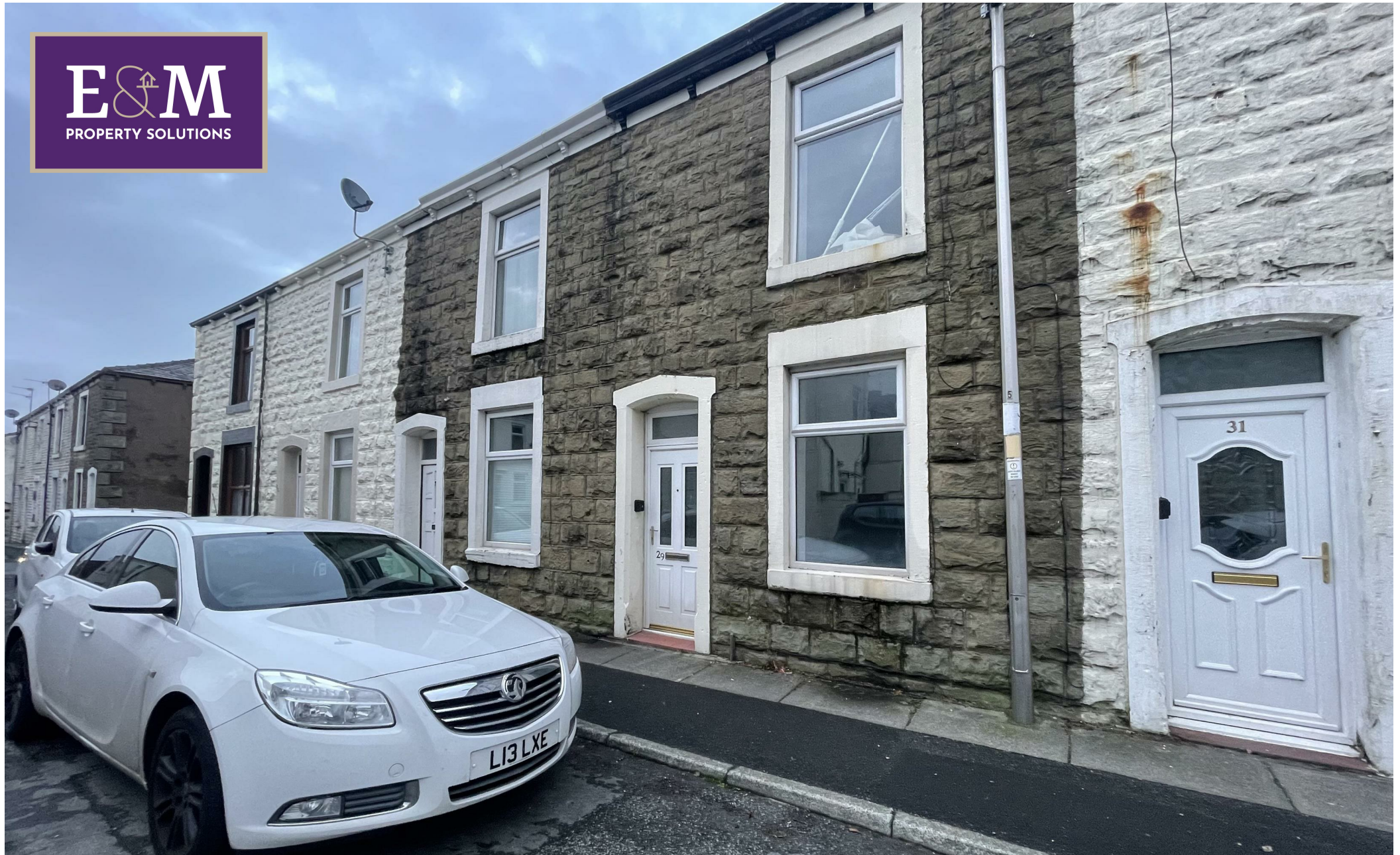
29 Henry Street, Blackburn, Lancashire, BB1 4JJ Asking price £100,000