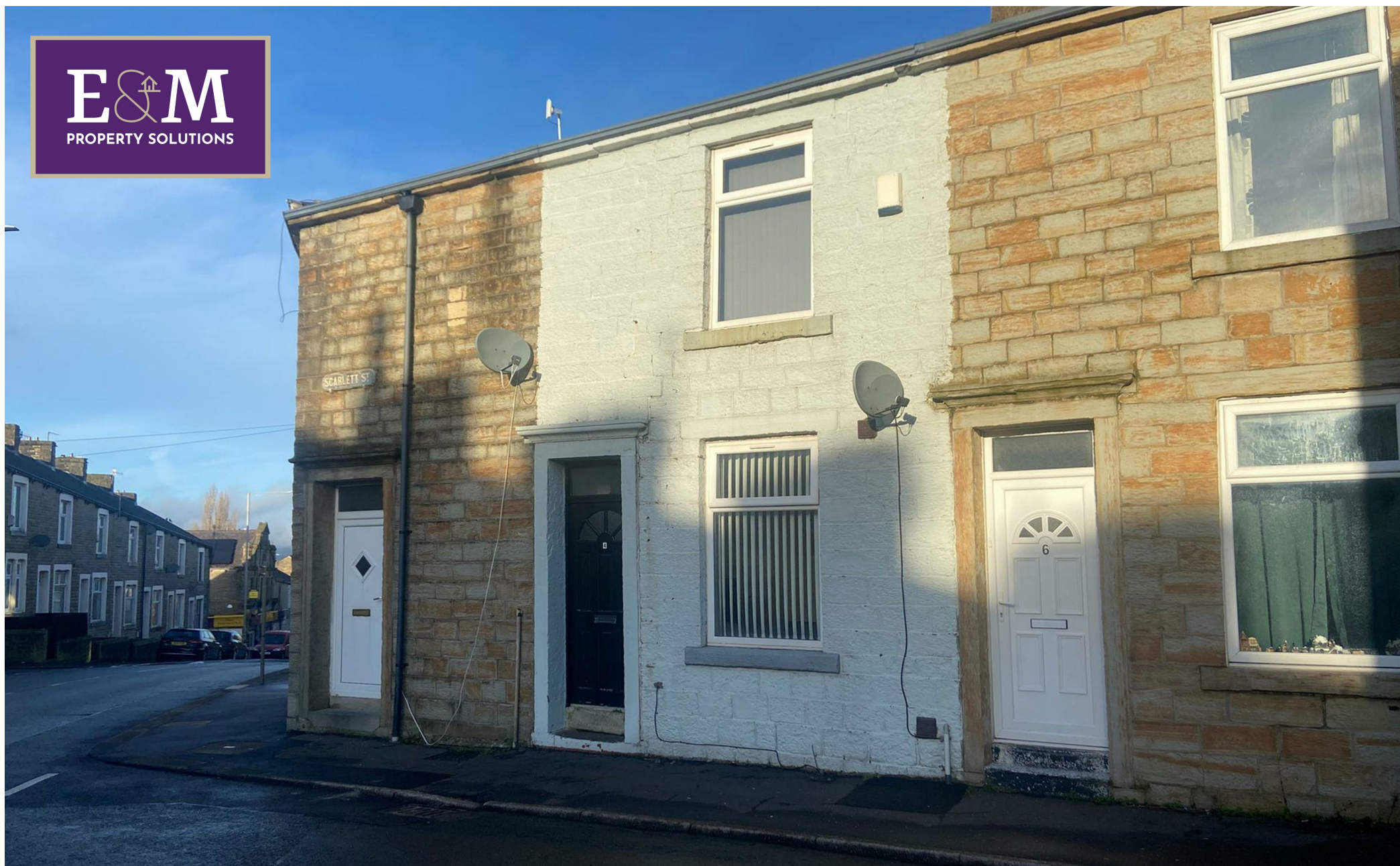
4 Scarlett Street, Burnley, Lancashire, BB11 4LQ £125,000