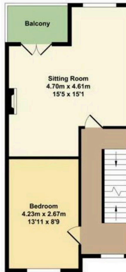
1st Floor Approx. Floor Area 41.72 Sq.M. (449 Sq.Ft.)