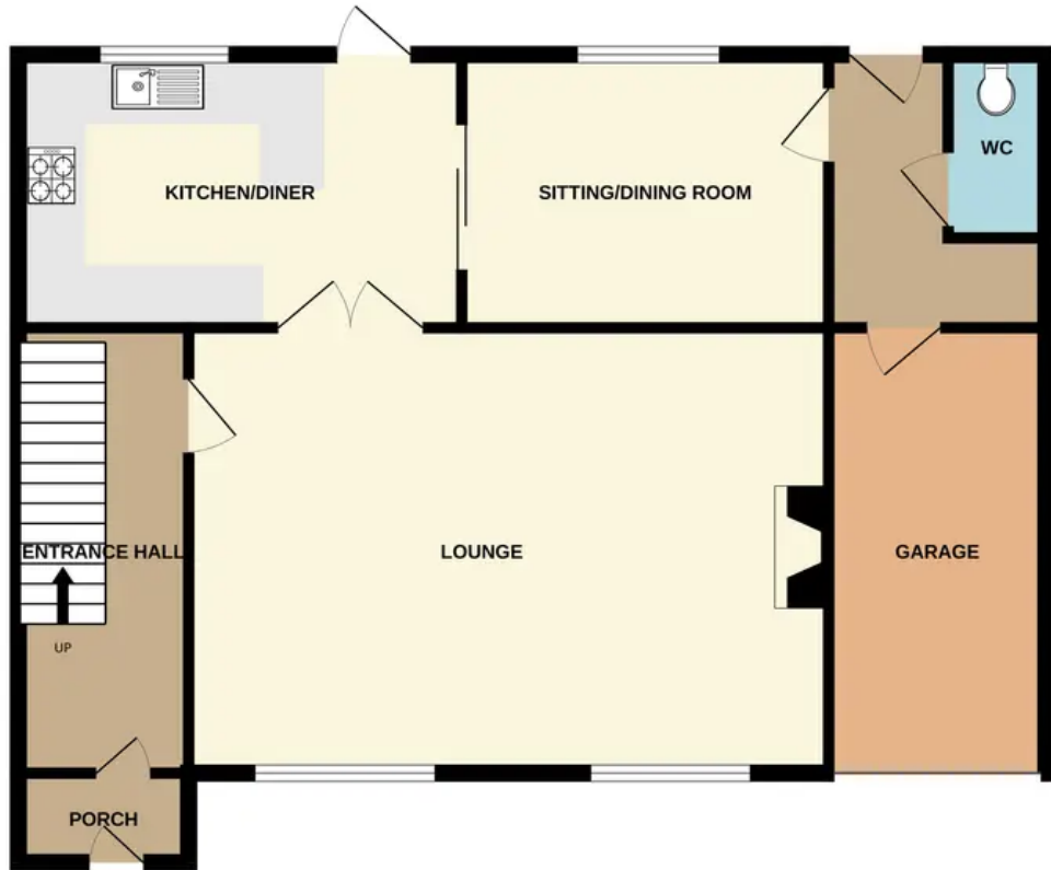
GROUND FLOOR 870 sq.ft. (80.8 sq.m.) approx.