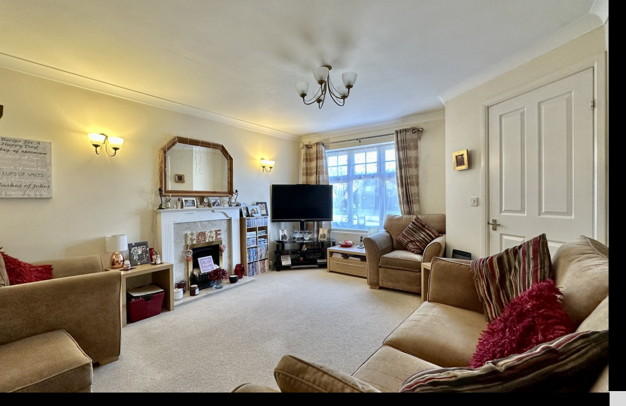
Our View "A nicely presented link-detached house in a quiet cul-de-sac location "