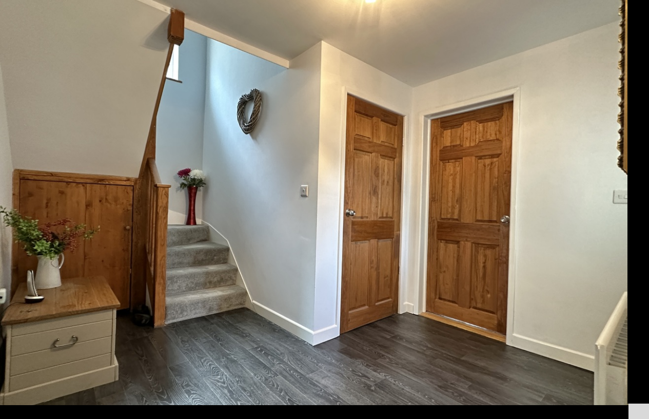
Our View "A well presented detached house in a central location "