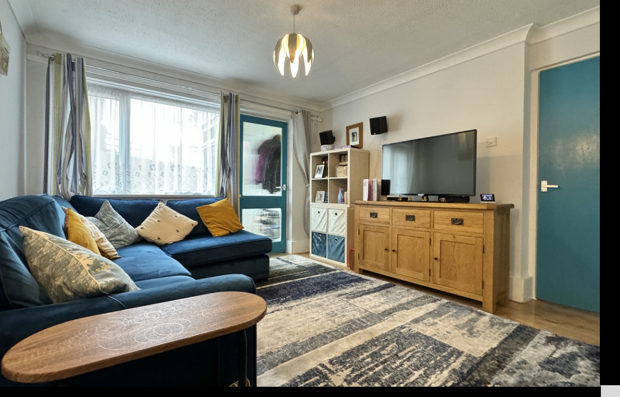
Our View "Ideal home for first time buyers or a buy to let landlord"