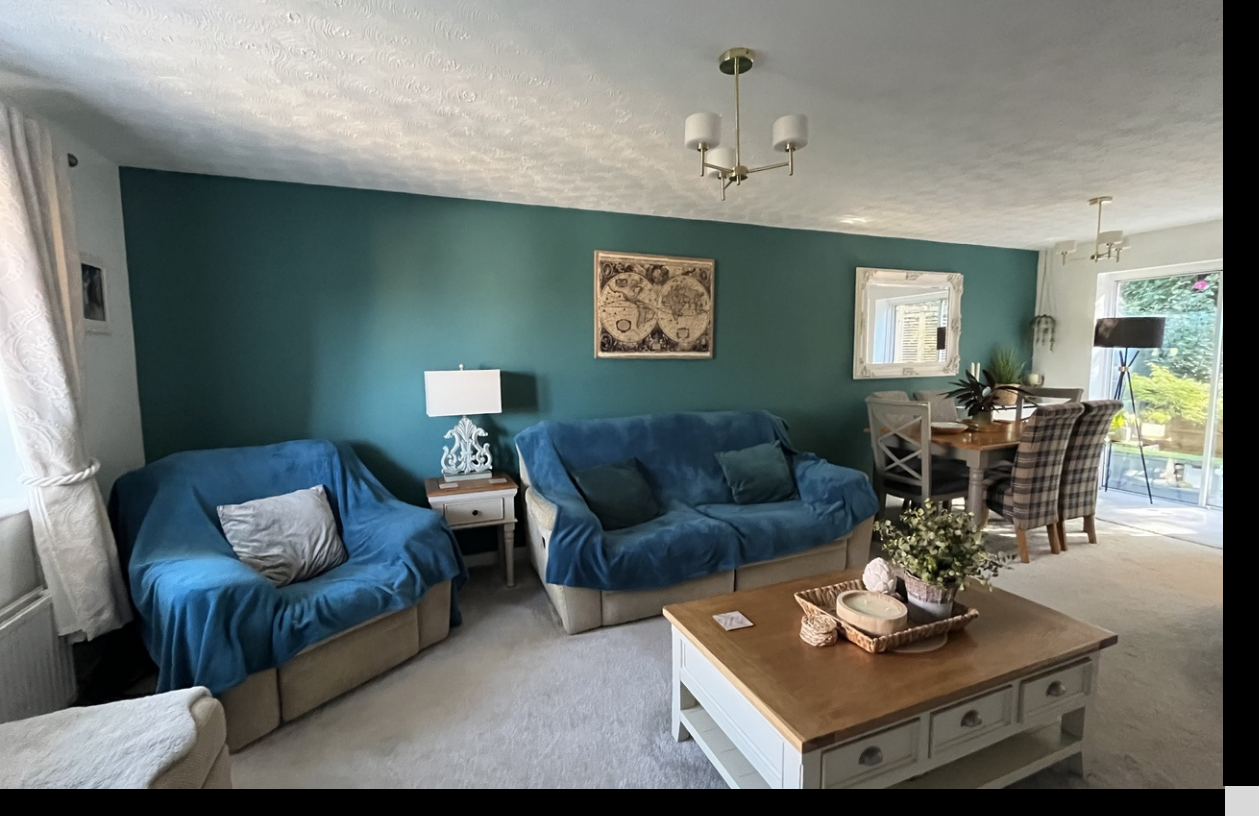
Our View "A well presented end of terrace house situated in a quiet cul de sac with a private well thought out garden. "