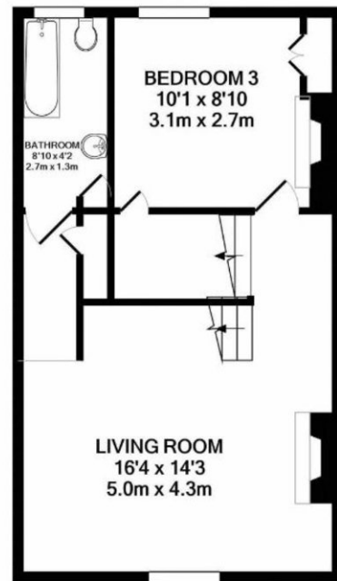
1ST FLOOR APPROX. FLOOR AREA 357 SQ.FT. (33.2 SQ.M.)