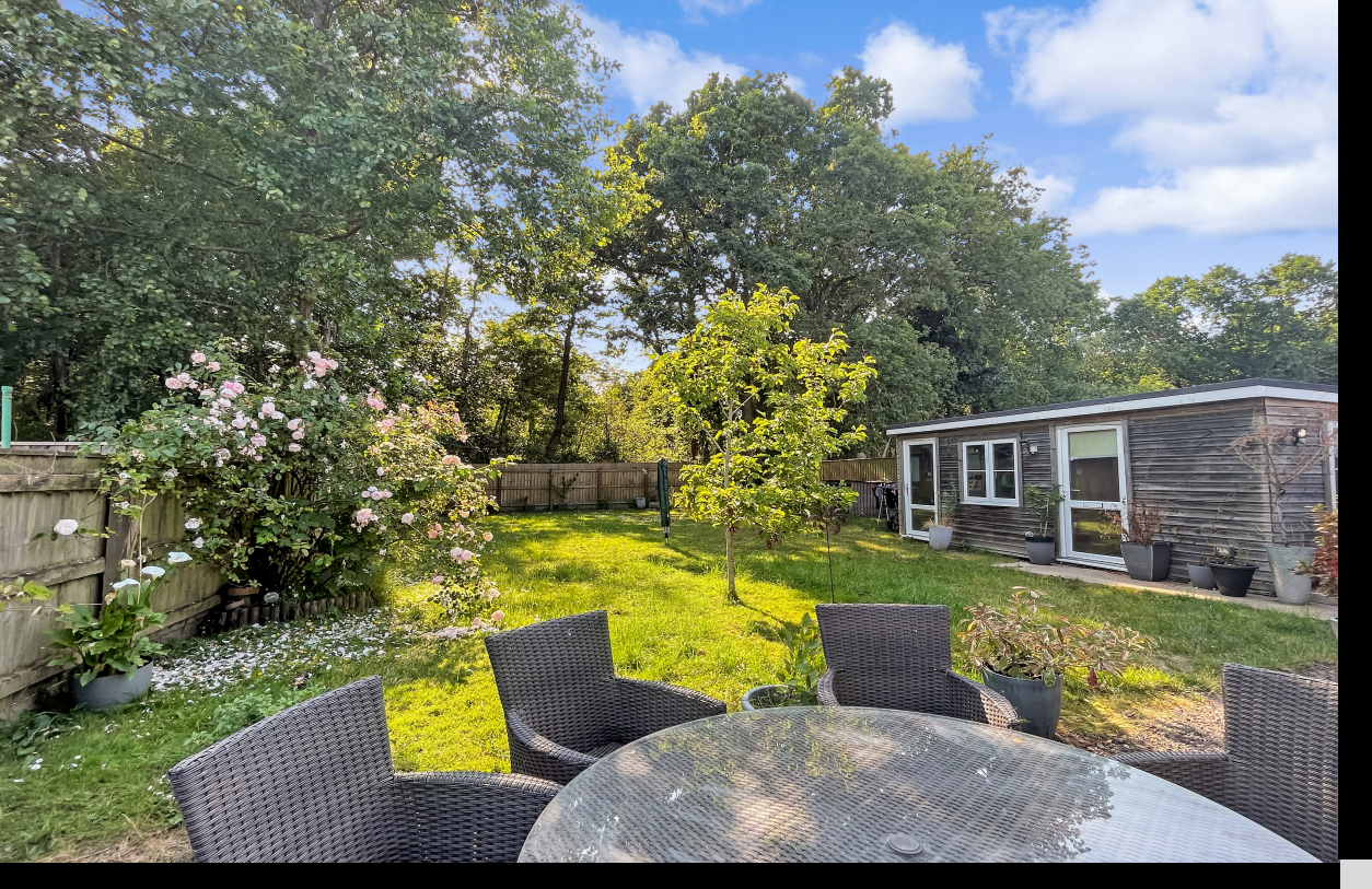
Our View "A spacious bungalow with further potential to create a lovely family home "