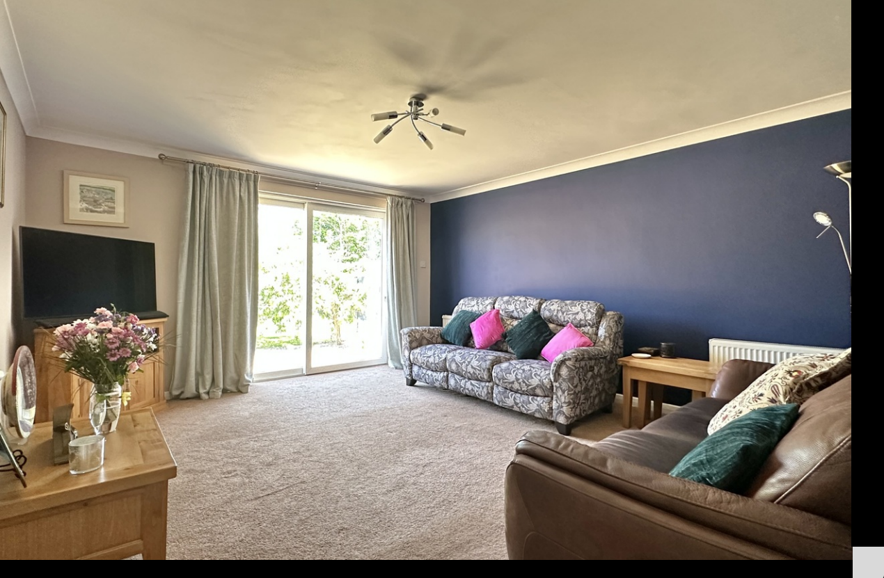
Our View "A lovely property with four double bedrooms and a large level garden "