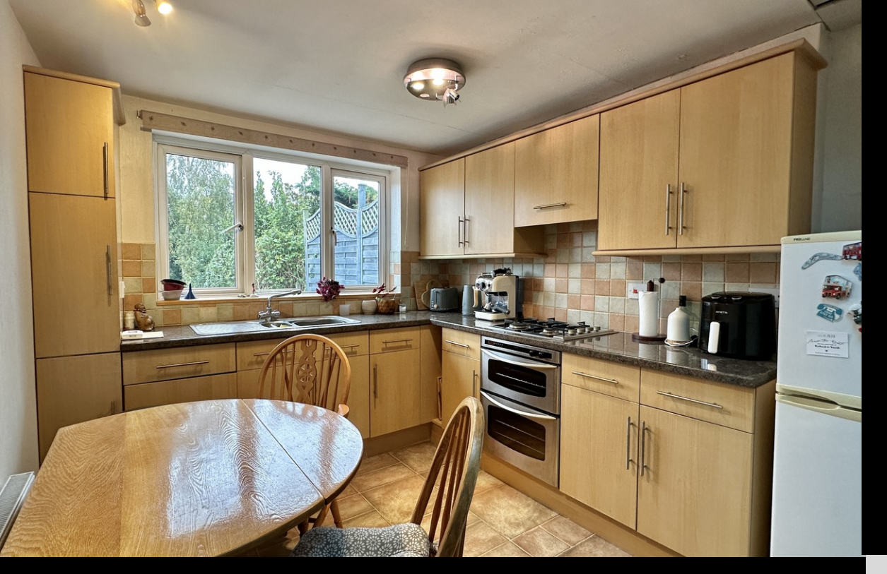
Our View "Property with potential for generational living, rental income or an investment opportunity. Must be seen."