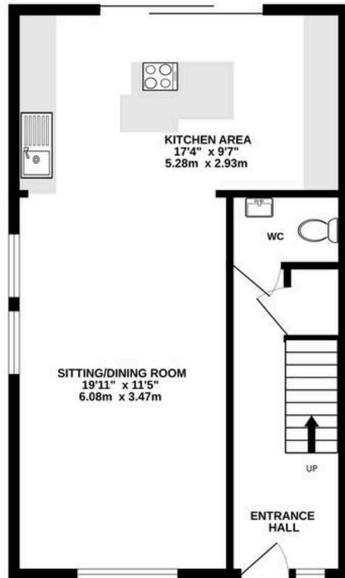
GROUND FLOOR 518 sq.ft. (48.1 sq.m.) approx.