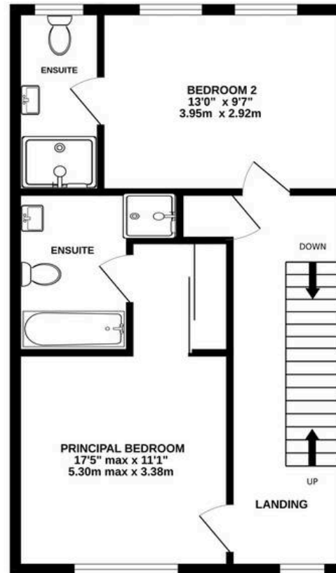
1ST FLOOR 508 sq.ft. (47.2 sq.m.) approx.