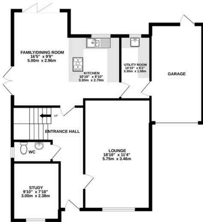
GROUND FLOOR 910 sq.ft. (84.5 sq.m.) approx.