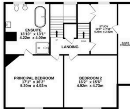
1ST FLOOR 2343 sq.ft. (218.0 sq.m.) approx.