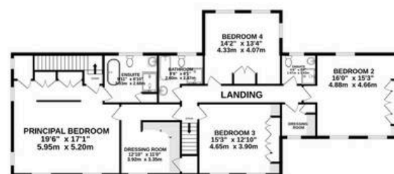
1ST FLOOR 1615 sq.ft. (150.0 sq.m.) approx.