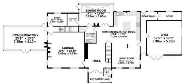
GROUND FLOOR 2551 sq.ft. (237.0 sq.m.) approx.