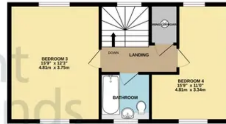
2ND FLOOR 475 sq.ft. (44.1 sq.m.) approx.