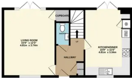
GROUND FLOOR 475 sq.ft. (44.1 sq.m.) approx.