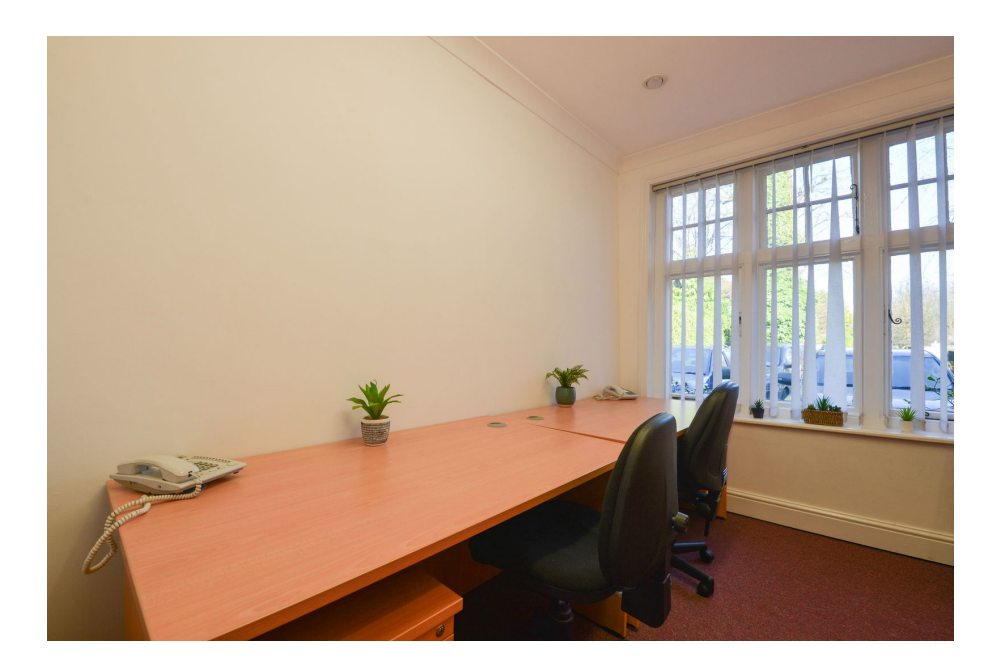
Tax Band: Furnished: Furnished Optional

Attractive Semi-Serviced Offices in a Grade II Listed Building located in East Horsley. Family Owned and Managed Since 1987. Enjoy superfast broadband with a BT Exchange nearby. ensuring top speeds for your business.