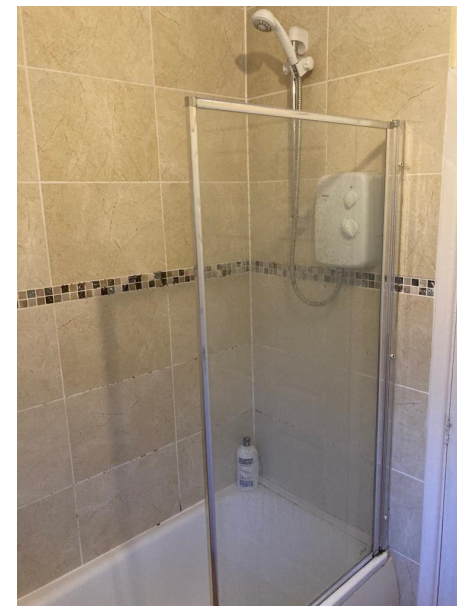
Illustration for identification purposes only, measurements are approximate, not to scale. Fourlabe.co © (ID1237066)